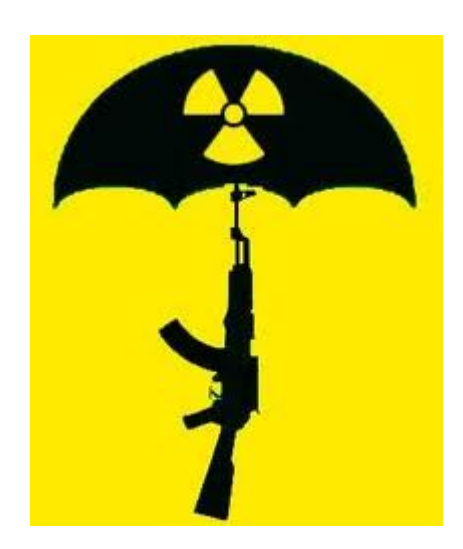
A Look at Pakistan

Oh, corporate profits are at stake. Zero's talking heads don't condemn India for refusing to sign the NPT, likely because India has opened its tribal areas to multinational mining companies. [16] Once those pesky tribes are removed (via Operation Green Hunt), massive profits can be made in destroying ecosystems for the underlying minerals.