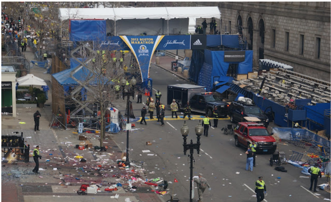
Image: The FBI truck and contractor SUV sit seemingly abandoned – neither the FBI agent, nor the contractors can be seen. What they did, or where they went remains so far, unknown. (click to enlarge)