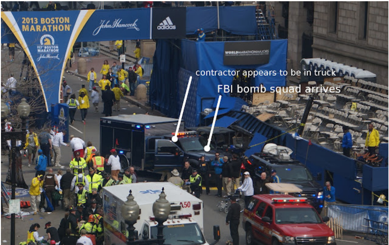
Image: What appears to be an FBI bomb squad truck pulls in, with a woman wearing what is clearly the letters F.B.I. on her vest. She talks with two contractors while it appears a third is partially in the truck's right-hand side. Also note that the area contractors and event staff tore up, is now taped off. (click to enlarge)