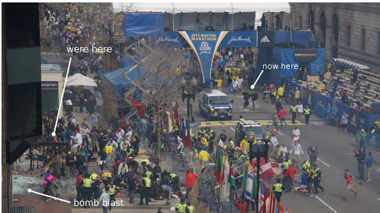
Image: After the explosion, two of the contractors seen by the wall next to the bomb, appear across the street, both using communication equipment. This photo too has been distributed and enlarged many times across the Internet. (click to enlarge)