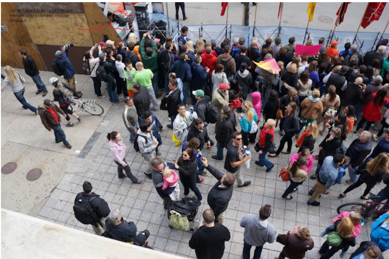
Image: An already widely distributed photo showing the contractor-types on the bottom left, just left of where the bomb was placed and detonated. The men are wearing matching, unmarked uniforms, large black bags, and appear to be waiting, separately, and “behind” the rest of the crowd. In the upper left corner, a wooden structure forming one half of a temporary photography “bridge” over the finish line can be seen and serves as a useful

The contractor-types had moved away from the bomb’s location before it detonated, and could be seen just across the street using communication equipment and waiting for similar dressed and equipped individuals to show up after the blasts.