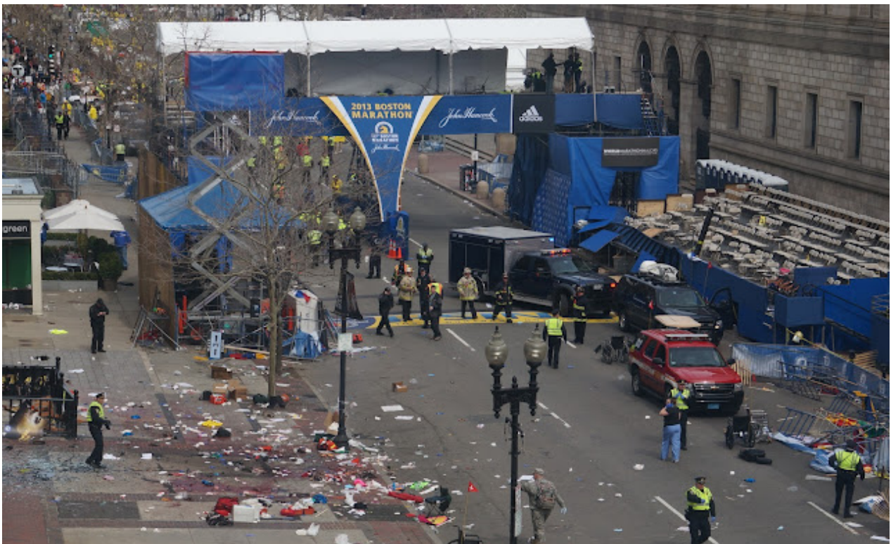
Image: The FBI truck and contractor SUV sit seemingly abandoned - neither the FBI agent, nor the contractors can be seen. What they did, or where they went remains so far, unknown. (click to enlarge)