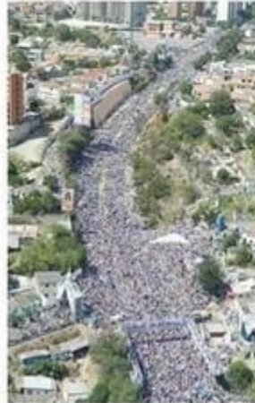
Imagen de la Divina Pastora llegó a la Catedral de Barquisimeto tras multitudinaria procesión Barquisimeto, 14 Ene. AVN.- La imagen de la Divina Pastora, patrona espiritual de los larenses, llegó a finales de la tarde de este martes a la Catedral de Barquisimeto, luego de la multitudinaria procesión que se inició en la iglesia del pueblo de Santa Rosa, santuario de la Virgen.

La Divina Pastora llegó a la Catedral de Barquisimeto tras multitudinaria procesión