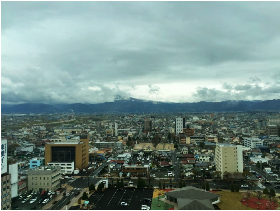
Clouds hang over Fukushima City

The most powerful legacy of Chernobyl, besides its long-lived radiation, is the widespread use of the word “radiophobia” by nuclear industry apologists to describe the public response to large releases of radiation: fear. Look for this word and sentiment in the many articles being published this month about Fukushima. When you see it, or read the claim that more people were harmed at Fukushima by their own irrational fears than by radiation, you are seeing the work of forgetting turn its cruel wheels. Behind those wheels are the shattered lives and emotional wellbeing of hundreds of thousands of people whose communities were destroyed, and whose families were ripped apart by the Fukushima disaster. People whose anxieties will rise every time they or their children run a high fever, or suffer a nosebleed or test positively for cancer. People whose suffering-at no fault of their own-is becoming invisible. Soon when we talk about Fukushima we will reduce the human impact to a quibbling over numbers: how many cases of thyroid cancer, how many confirmed illnesses. Lost-hidden-forgotten will be the hundreds of thousands of people forced to flee their homes, in many cases permanently, and try to rebuild their shattered lives. Public relations professionals and industry scientists will say that these people did this to themselves (see here , and here ). And the curtain will draw ever downward as we forget them.