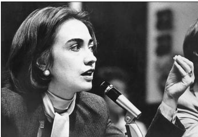
Image: Hillary Clinton as a young Watergate lawyer.

Hillary skillfully used an arsenal of "opposition researchers and private detectives," that her mentor Dick Morris identified as "secret police," in a systematic campaign to "intimidate, frighten, threaten, discredit and punish innocent Americans [critical of the Clinton's] whose only misdeed is their desire to tell the truth." [4]