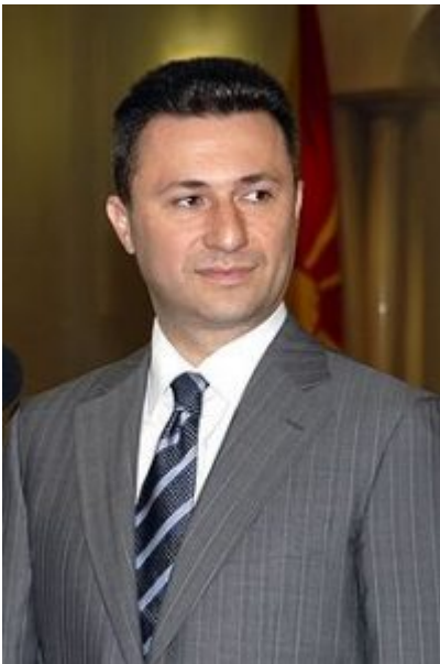
PM of Macedonia Nikola Gruevski

Q: During this period we see the whole Western propaganda media machinery aggressively attacking the government of VMRO-DPMNE, while their main target seems to be its leader Nikola Gruevski. This demonization of Gruevski is being done in a very similar way like it has been for years now when it comes to the Russian President Vladimir Putin. For example, they are calling Gruevski a dictator, although his ratings are 6 times higher than the ones of the opposition leader Zoran Zaev. What are the mutual characteristics that made both Putin and Gruevski such a big “enemies” of the West?