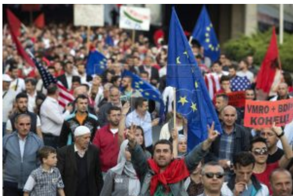
A cocktail of Albanian, EU and US flags in hands of duped Albanian elements in Skopje.

It’s important to point out at this time that there’s really no objective reason for why some Albanians would even want to “federalize” (internally partition) the country except out of their misguided nationalist pursuit in seeking to replicate the calamitous Kosovo scenario and construct “Greater Albania”. No minority group in the world has better constitutionally enshrined rights than the Albanians who live in the Republic of Macedonia. The only likely explanation for why some members of this demographic might want to agitate for even more generous privileges than they already have, and thus risk throwing the country into chaos and reversing all of their existing gains as result, is because of the influence of external actors that don’t sincerely care about their welfare, such as Albanian-based nationalists and the Albanian, Turkish, and American governments. These entities don’t acknowledge the truth that Macedonian Albanians have a better quality of life and more constitutionally guaranteed rights than any other category of Albanian anywhere else in the world (including in Albania proper), but instead perniciously seek to mislead them into falsely thinking that they’re experiencing the exact opposite and are victims of “system oppression”.