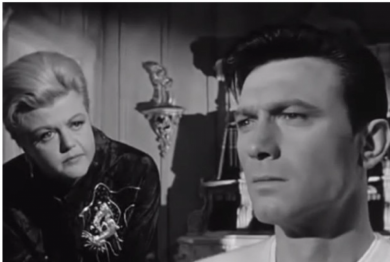
Angela Lansbury and Laurence Harvey in The Manchurian Candidate, in 1962. That movie, and the Richard Condon novel it was drawn from, imagined foreign attempts to direct the outcome of a U.S. presidential election. Yesterday the U.S. government said that Russian hackers have been deliberately trying to change the outcome of this year's race.