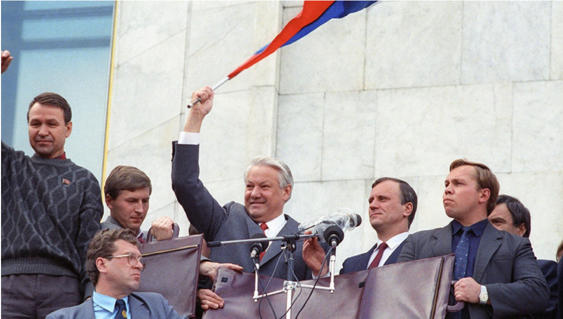
Yeltsin on 22 August 1991 (Licensed under CC BY 4.0)

An ideological-political background of Boris Yeltsin's foreign policy of Russia was Atlanticism – an orientation in foreign policy that stresses the fundamental need to cooperate (at any price) with the West, especially in the area of the politics and economy. In other words, the integration with the West and its economic-political standards became for Boris Yeltsin's Russia, governed by the Russian liberals, an order of the day. This trend in Russia's foreign policy in the 1990s had roots in the 19th-century geopolitical and cultural orientation of the Russian society by the so-called Russian "Westerners" who became the opponents to the Russian "Slavenophiles" for whom the ultimate aim of the Russian foreign policy was to create a Pan-Slavonic Commonwealth with the leadership of Russia.