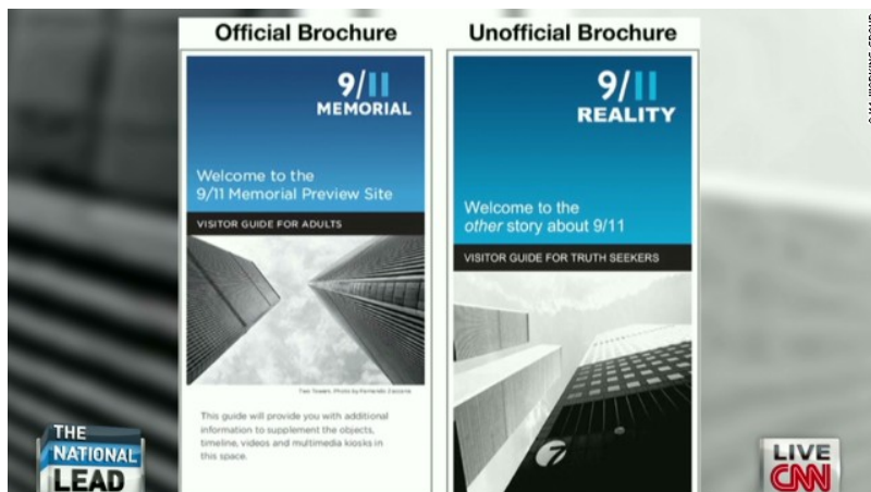
Brochure comparison: Official vs

“Of course they don’t prove anything except for man’s capacity to believe crazy things and man’s insensitivity to, for instance, the families of the approximately 3,000 people killed at the World Trade Center, the Pentagon, and in a field in Pennsylvania by Islamic terrorists with al-Qaeda, as every credible investigation has actually proven.”