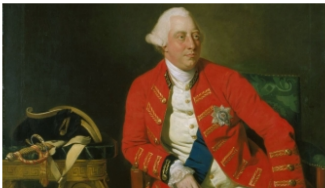
King George III

Third political parties that wish to give the voters more voices and choices are held down by the big two-party duopoly. Independent new parties know what closing democracy’s door is like from ballot access obstacles to exclusion from the candidate debates.