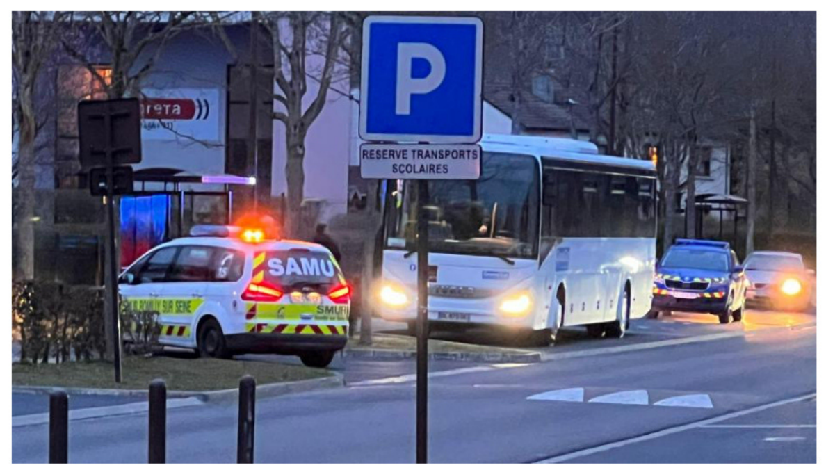
The driver was parked on the bus lanes in front of the school city of Sézanne.

A victim of heart discomfort, a bus driver died in front of the school city of Sézanne (Marne). The students on the bus were evacuated.