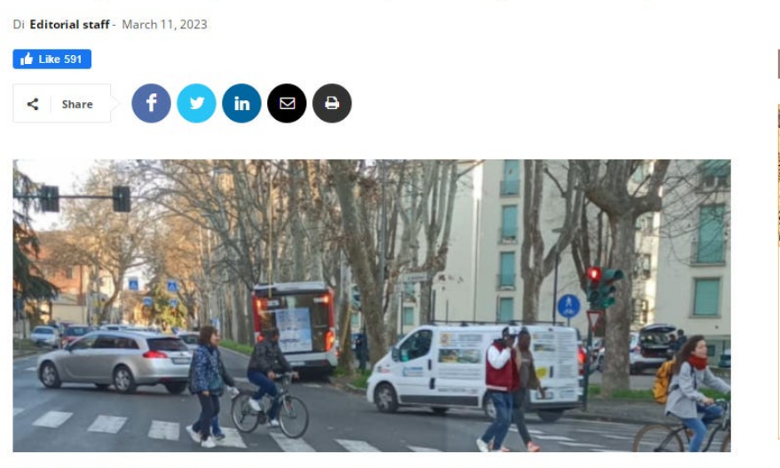
EMILIA REGGIO – Tragedy touched in the afternoon in Viale Piave where a public transport of line 5 at that full moment crashed into a tree due to a sudden illness of the driver.

Fortunately at the time of the accident nobody was crossing the road at that point. The driver was taken to the hospital