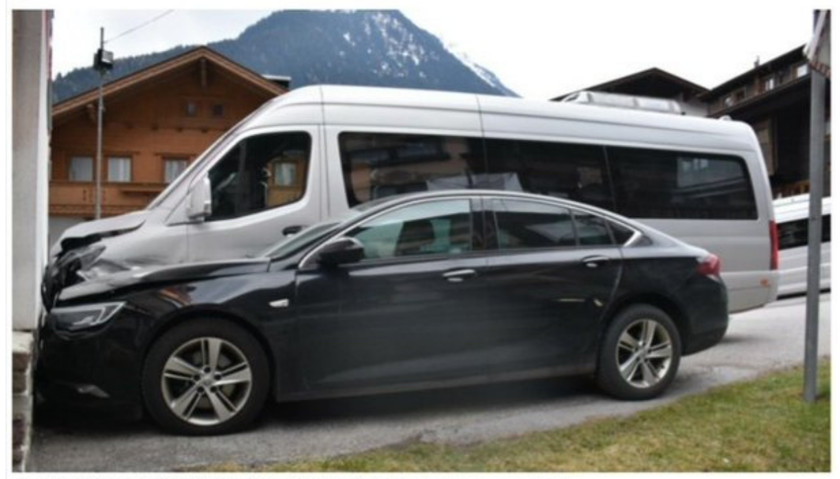
Both vehicles and the house facade were damaged.

The occupants of a bus in the Tyrolean Zillertal had to live through anxious moments late Sunday afternoon: Due to a medical emergency, the driver lost control of the vehicle and crashed into a parked car. The chauffeur was flown to the Innsbruck clinic with the emergency doctor helicopter. The passengers escaped with a fright.