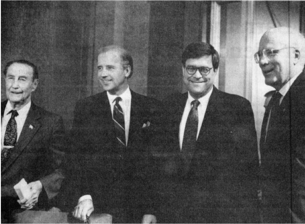
William Barr is heading the drive in Virginia to turn prisons into slave labor camps. Here he is shown during a hearing at the Senate Judiciary Committee, Nov. 12, 1991, on his nomination as Attorney General in the Bush administration. Left to right: Sen. Strom Thurmond, Sen. Joseph Biden, Barr, Sen. Patrick Leahy.