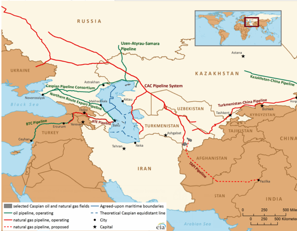
Major Caspian oil and natural gas export routes

Yet the Caspian has attracted increasing attention in Washington over the past 30 years. It was identified by high-ranking officials like Dick Cheney as critically important (7). The Pentagon sent abroad armed personnel from military organisations like Blackwater, with the aim of protecting the oil and gas pipelines in the Caspian region.