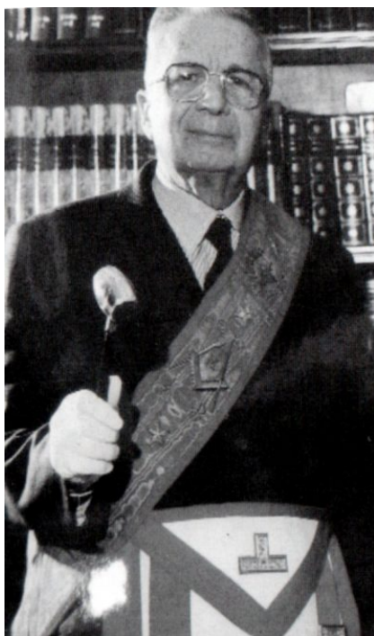
Image on the right: Licio Gelli, member of the far-right Italian masonic lodge Propaganda Due (P-2).

It was the Gladio-linked neofascist organization Avanguardia Nazionale, contracted by DINA, that carried out the failed attempt on Bernardo Leighton's life. DINA agents and even Pinochet himself met in advance of the assassination with its leader, Stefano Delle Chiaie, who later worked for DINA and, he claimed , helped create it, before going to serve alongside Barbie in Bolivia's coup government. Delle Chiaie also happened to meet personally with Pinochet just days before the Chilean dictator formalized the creation of Condor, and he arrived in Chile to get to work shortly thereafter.