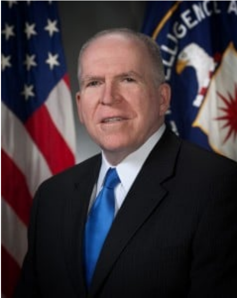
John Brennan, currently CIA director, previously served as director of the Terrorist Threat Integration Center.

Legal issues covered in these Studies articles include prepublication review, the protection of the identities of U.S. intelligence officers, and assassination. The prepublication review process is treated ( Document 24 ) by a former Directorate of Intelligence representative to the Publications Review Board, who offers an anodyne view of the process and an extensive list of “myths and realities.” 4