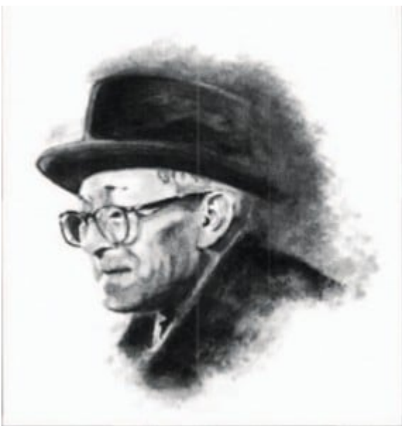
Image, right: James Jesus Angleton, head of counterintelligence and “CIA's answer to the Delphic Oracle” from 1954-1974.

Various works on intelligence have noted both the past competition and present cooperation