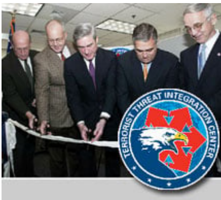
Ribbon-cutting ceremony at the Terrorist Threat Integration Center, May 1, 2003.

Two additional articles concern events separated by over two hundred years. One ( Document 7 ), focuses on Britain's penetration of the United States diplomatic mission to France during the Revolutionary War. Penetration involved British recruiting of agents with access to mission members, theft of a mission member's journal and Britain's control of agents ostensibly operating on behalf of the United States.