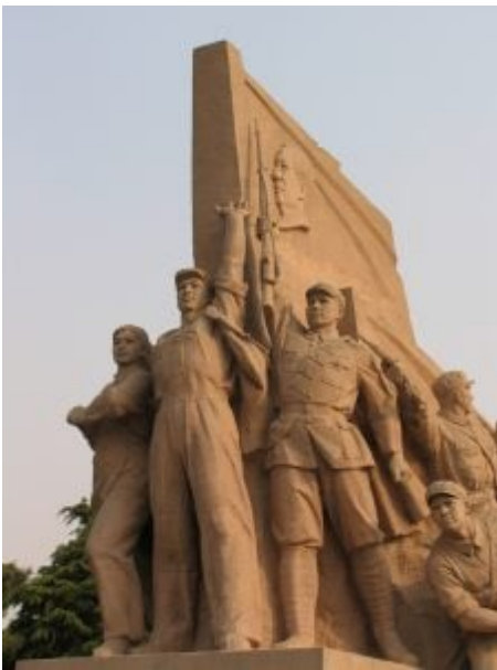
Communist Victory in Beijing, China

Many who supported this goal, however, did not suppose that announcing it committed China to major changes in the present. Many have argued that China’s first task was to modernize, meaning especially industrialize, and become a wealthy nation. Then it would have the luxury of attending to the natural environment. Few, if any, thought it meant that China would turn away from the goal of economic growth to pursue something different.