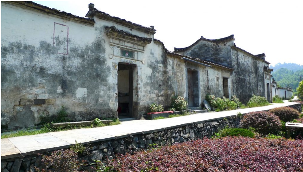
Wuxi – medieval ecological village

As I compare China's success in giving serious attention to the well-being of its natural environment and needy citizens with that of European countries, my reason for betting on China is that I have some confidence that it will maintain governmental control of finance and of corporations generally. If it does this, it can also control the media. Thus, it has a chance of making financial and industrial corporations serve the national good as perceived by people not in their service. Less centralized governments are less able to control the financial and other corporations whose short-term interests may conflict with the common good.