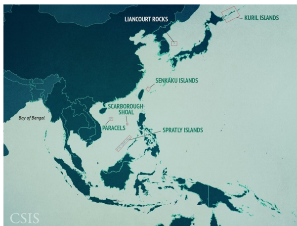
Map showing the location, within the South China Sea, of the Paracels, the Spratlys, and Scarborough Shoal

The Second Indochina War is not as significant, but it still means that for years US forces operated in some of the regions under dispute, following agreements with the Republic of Vietnam and other states in the region, including the Philippines. Although again not the purpose of this paper, any examination in depth of American policy concerning the territorial dispute over the South China Sea cannot ignore this episode. Instead, the diplomatic history of the period should be examined in the search for evidence of any event or document of legal significance.