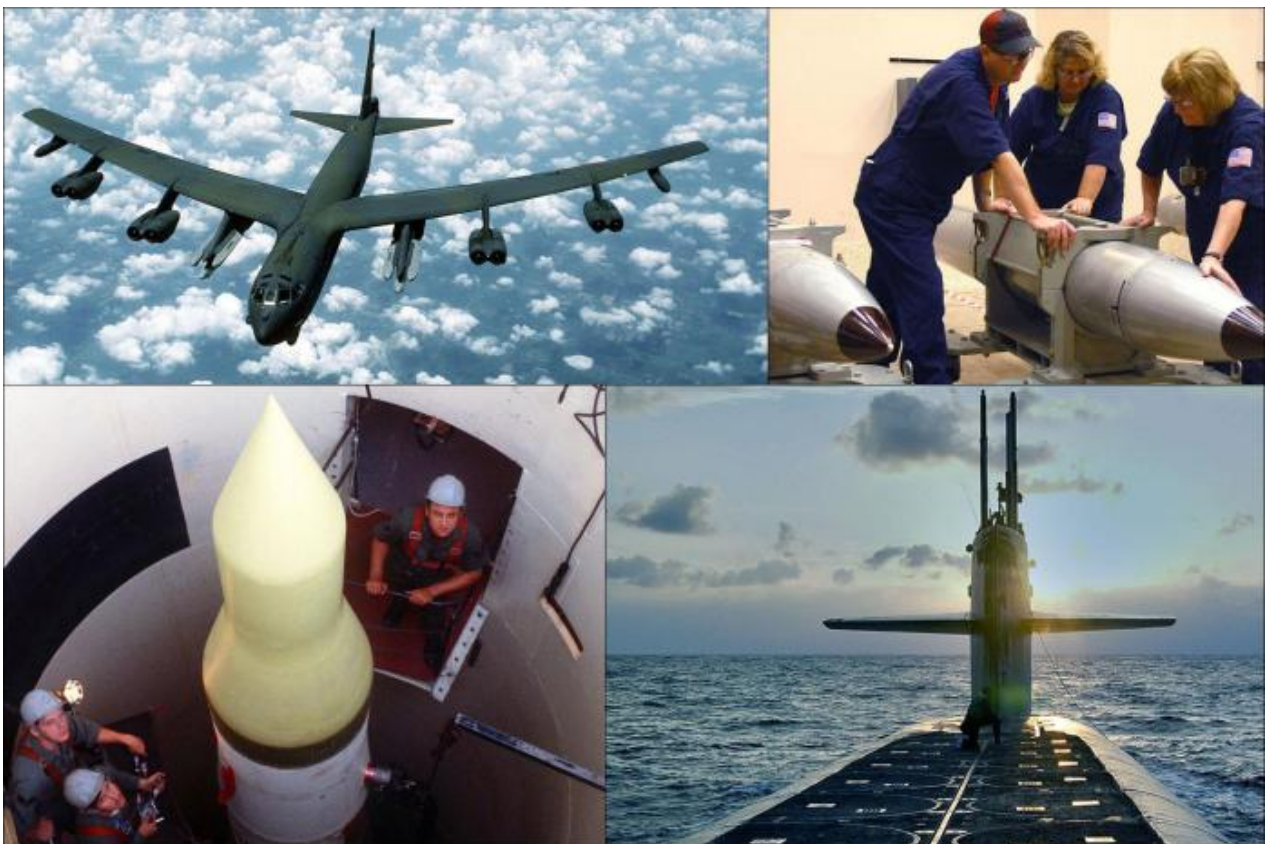
U.S. nukes

Besides specifying his intent on preparing U.S. forces to wage nuclear war, Cotton used his confirmation hearing to make a pitch for an even bigger budget for the U.S. nuclear arsenal—when the U.S. government is already slated to spend $634 billion over the 2021-2030 period , for an average of $60 billion per year , according to the Congressional Budget Office.