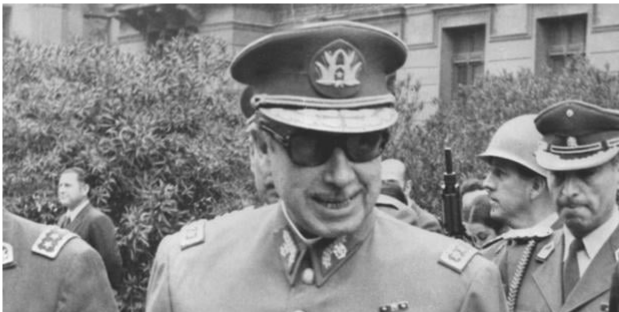
Augusto Pinochet, 1973

The main objective of the US-supported military coup in Chile was ultimately to impose the neoliberal economic agenda. The latter, in the case of Chile, was not imposed by external creditors under the guidance of IMF. “Regime change” was enforced through a covert military intelligence operation, which laid the groundwork for the military coup. Sweeping macro-economic reforms (including privatization, price liberalization and the freeze of wages) were implemented in early October 1973.