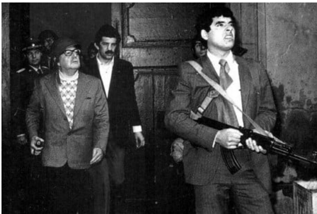
Salvador Allende in the defense of the Palacio de la Moneda, September 11, 1973 (left)

At the time of the September 11, 1973 military coup, I was Visiting Professor of Economics at the Catholic University of Chile. In the hours following the bombing of the Presidential Palace of La Moneda, the new military rulers imposed a 72-hour curfew.