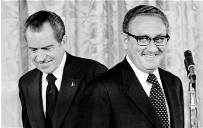
(Nixon and Kissinger, image right)