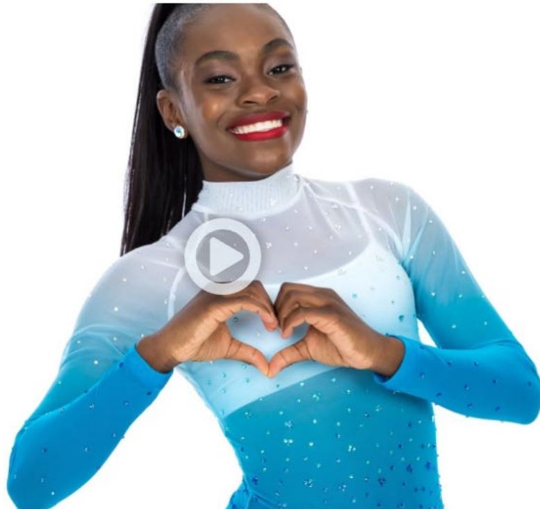
Johns Creek mother starts foundation to honor daughter who died unexpectedly