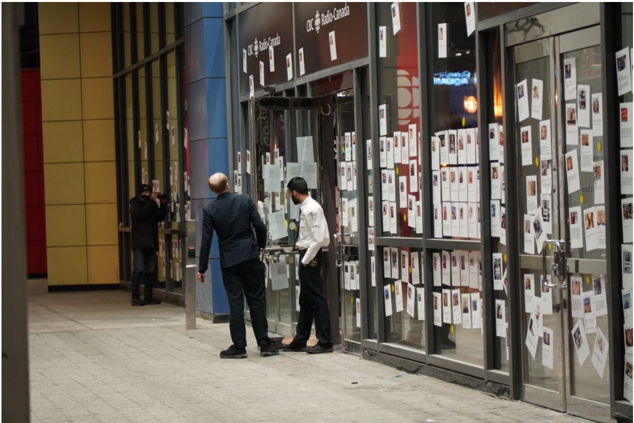
After looking at the profiles, security guards return indoors.