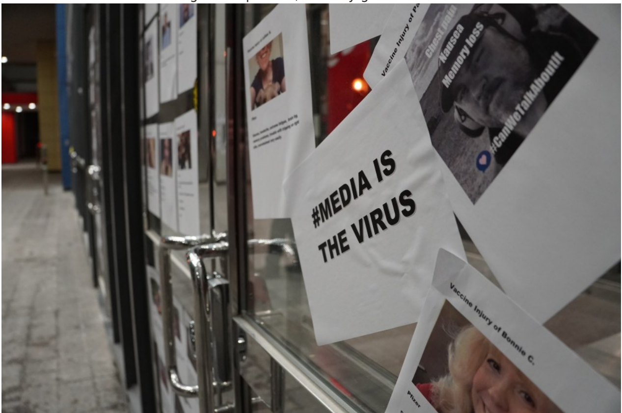
Charges of “vaccine” adverse events complicity for the CBC and mainstream media.