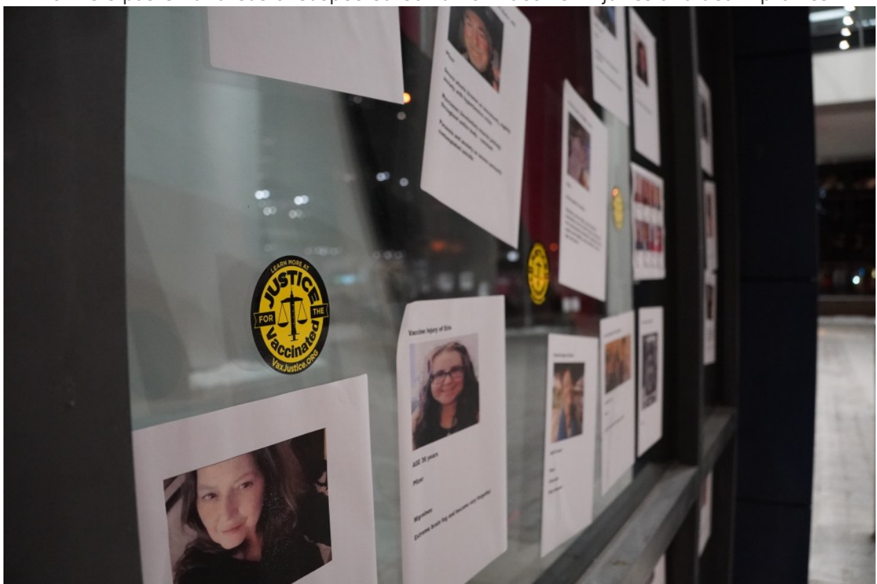
“Justice for the Vaccinated” stickers appeared on the doors and windows.