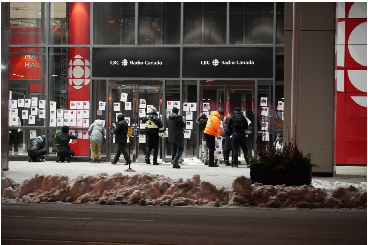
Activists paste hundreds of suspected Covid-19 “vaccine” injuries and death profiles.