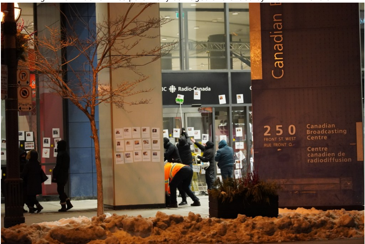
Activists plaster profiles high and low