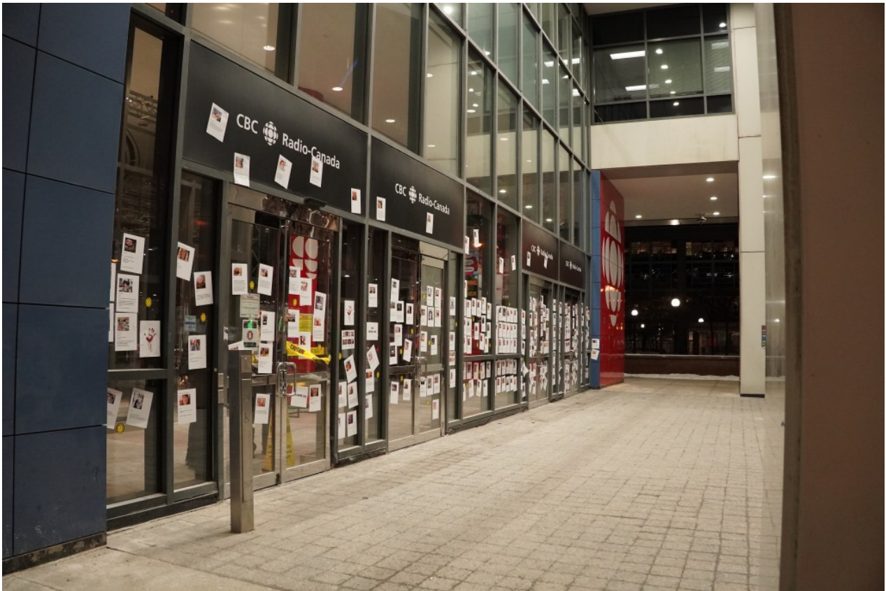
A grim reminder of lives potentially damaged and ended by the mRNA shots.