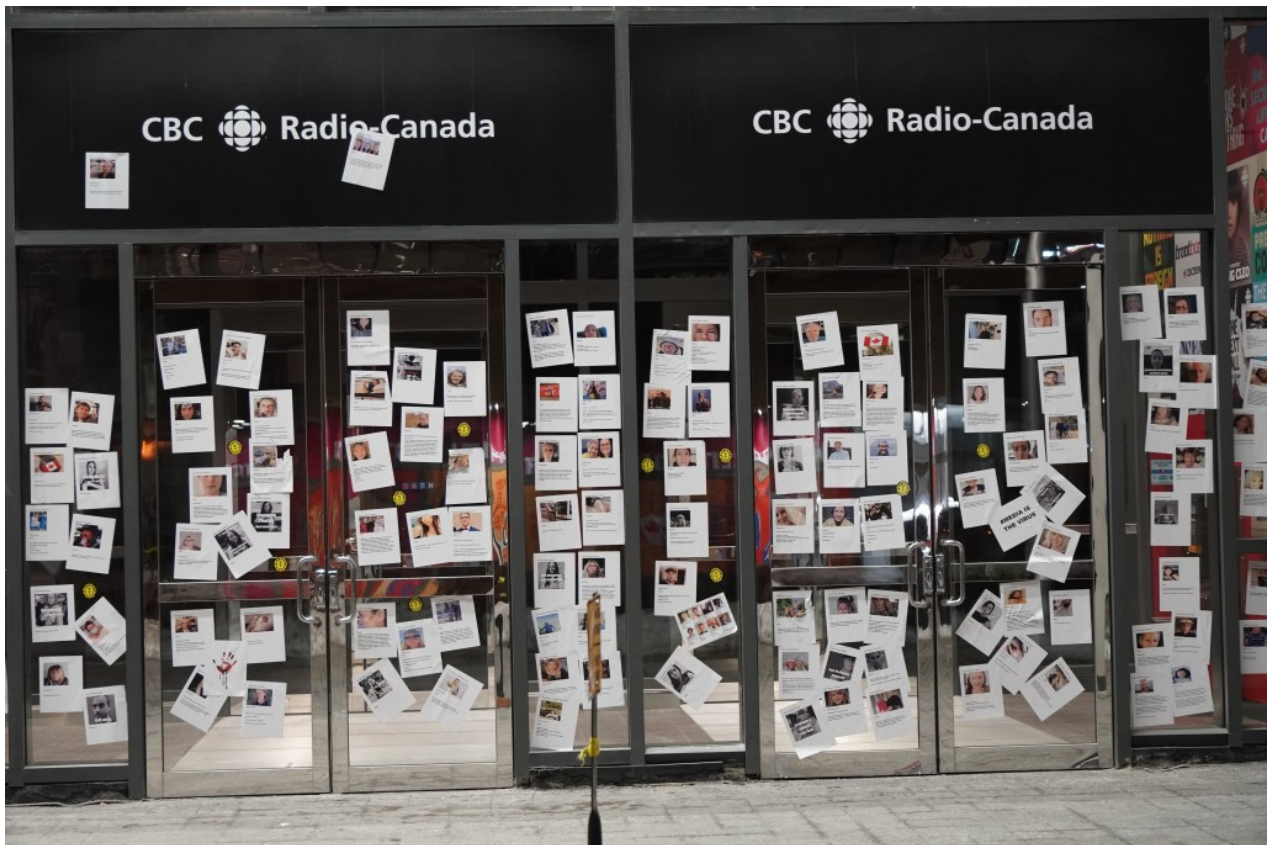
CBC building front doors.