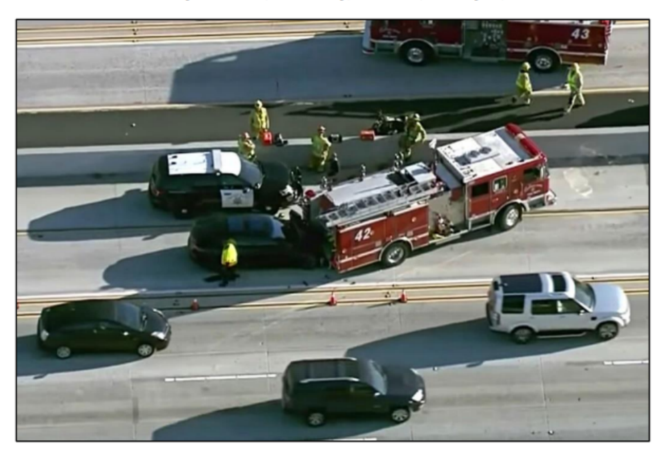
Figure 2. Overhead view of crash scene showing Tesla and fire truck at final rest on southbound I-405.

Here is how the NTSB characterized the accident in its final report: