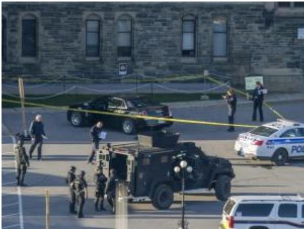
Yet Another Coincidental War Game

authorities] may talk today in terms of being surprised but we know that this precise scenario has been keeping them up at night for a while. [xiv]