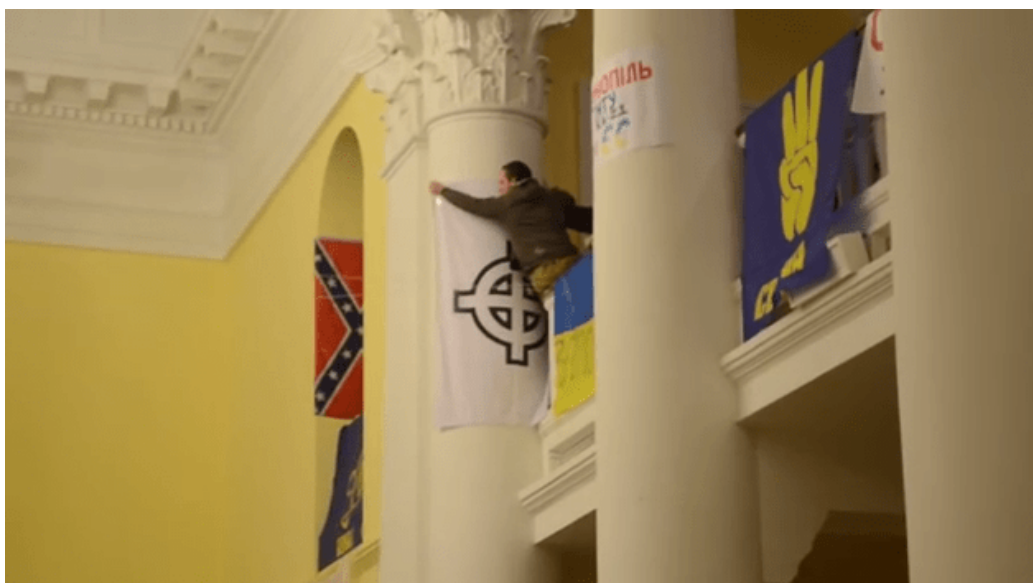
Canada’s Foreign Ministry provided shelter to the neo-Nazis (above) who occupied and vandalized Kiev’s city hall in 2014.

In the midst of the coup attempt, a group of neo-Nazi thugs belonging to the C14 organization occupied Kiev’s city council and vandalized the building with Ukrainian nationalist insignia and white supremacist symbols, including a Confederate flag. When riot police chased the fascist hooligans away on February 18, 2014, they took shelter in the Canadian embassy with the apparent consent of the Conservative administration in Ottawa. “Canada was sympathizing with the protesters, at the time, more than the [Ukrainian] government,” a Ukrainian interior ministry official recalled to the Canadian Broadcasting Corporation.