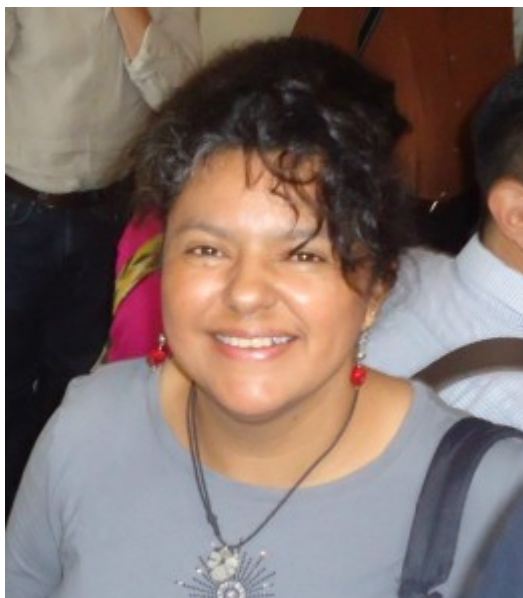
Image below: Berta Isabel Caceres, Assassinated, March 3, 2016.

Of all the Central American countries, Honduras is most open to free trade; it is also one of