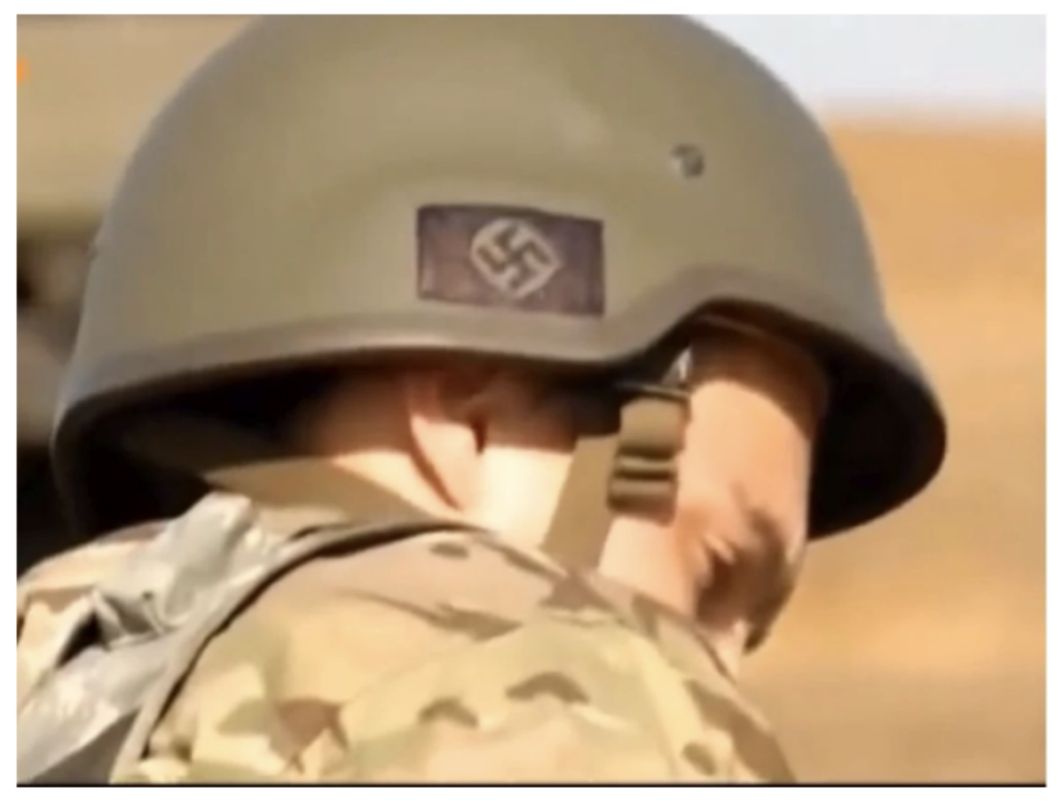
File photo: A news broadcast by German ZDF station showed soldiers of the Ukraine Azov Battalion with nazi symbols on their helmets.

David Pugliese • Ottawa Citizen Nov 08, 2021 • November 9, 2021 • 4 minute read