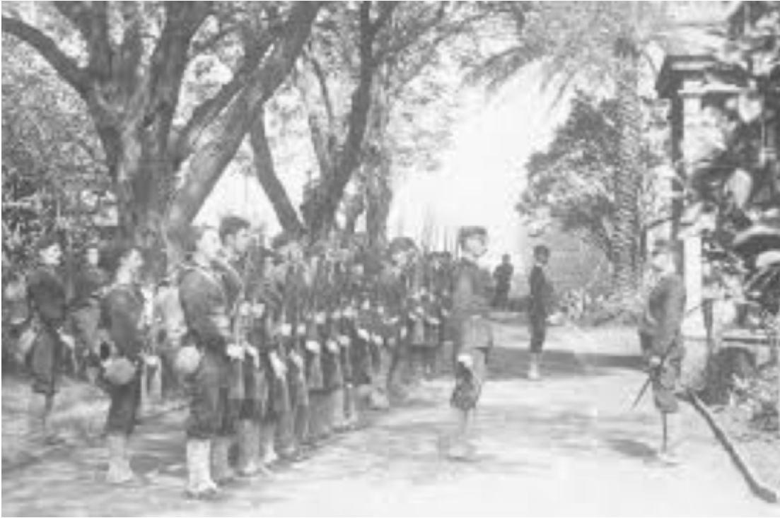
Troops from the USS Boston Honolulu January 17, 1893

As the reading of the proclamation of this self-proclaimed Provisional Government was taking place, the U.S. Bluejackets stood guard on Mililani Street. After receiving and reading the proclamation, the U.S. Minister, John L. Stevens, officially recognized this Provisional Government as the government of Hawaii.[iv]