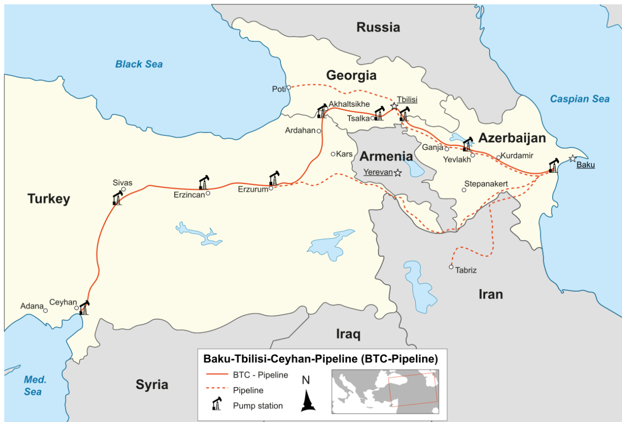
Location of Baku-Tbilisi-Ceyhan pipeline

A few weeks after 9/11, Georgia's president Eduard Shevardnadze visited the American capital, where he pledged his backing in the "war on terror". Shevardnadze asked for economic and military aid from the Americans, and he signed a strategic partnership with NATO. He also authorized the construction of the previously mentioned pipeline, which would be commissioned in 2006. Yet the Georgian president's position had become precarious. He was politically weak and isolated; Georgia's foreign debt had rocketed to $1.75 billion and Shevardnadze had no way of paying it off. This instability in Georgia was viewed with concern in Bush's White House, who feared that the country would return to Russia's orbit of control.