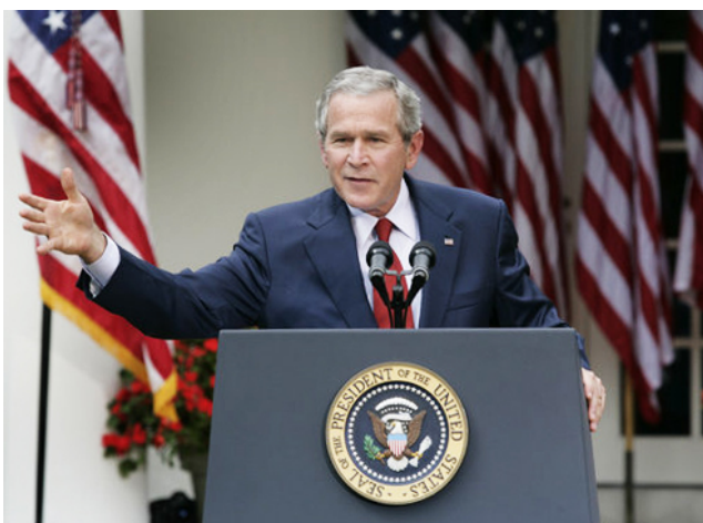
Image on the right: President Bush makes remarks in 2006 during a press conference in the Rose Garden about Iran’s nuclear ambitions and discusses North Korea’s nuclear test

This strategy, known as the Bush Doctrine, had actually originated before 9/11, not after. The Bush Doctrine was developed together with the “freedom agenda”, which Bush wanted to use to support “inexperienced democratic governments” in the Ukraine, Georgia and Lebanon, to name but three; and strengthening dissidents in the “repressive regimes” of Syria, Iran, North Korea and Venezuela.