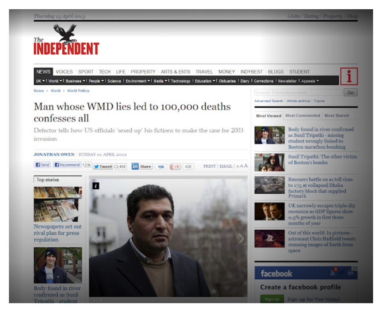
Image: From Independent's "Man whose WMD lies led to 100,000 deaths confesses all: Defector tells how US officials 'sexed up' his fictions to make the case for 2003 invasion." In retrospect, the corporate-media has no problem admitting the insidious lies that were told to justify the invasion and occupation of Iraq – the lead up to the war was another story. A verbatim repeat of these admitted lies are being directed at Syria amidst the West's failure to overthrow the government with terrorist proxies.

Astonishingly, the West is attempting to repeat tales of "WMD's" in Syria, just as it infamously did in Iraq. In the Washington Post's "<u>U.S. intelligence agencies: Assad used chemical weapons 'on a small scale'</u>," the nature of this "evidence" is elaborated on (emphasis added):