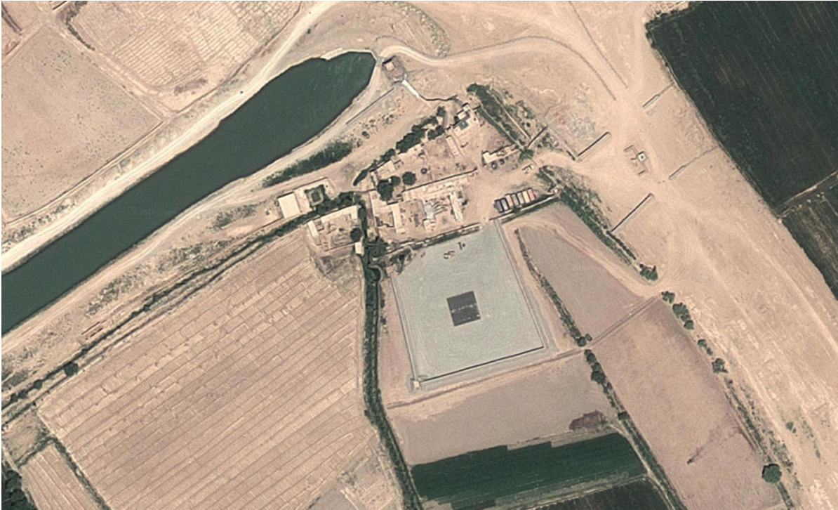
A satellite image showing the British Army's Quadrat base in the district of Nad-e Ali in Afghanistan

"Then they took a right turn along a canal and headed away from us. When they were about 300 yards away from us, a corporal decided to fire a GPMG (general-purpose machine gun) into them.