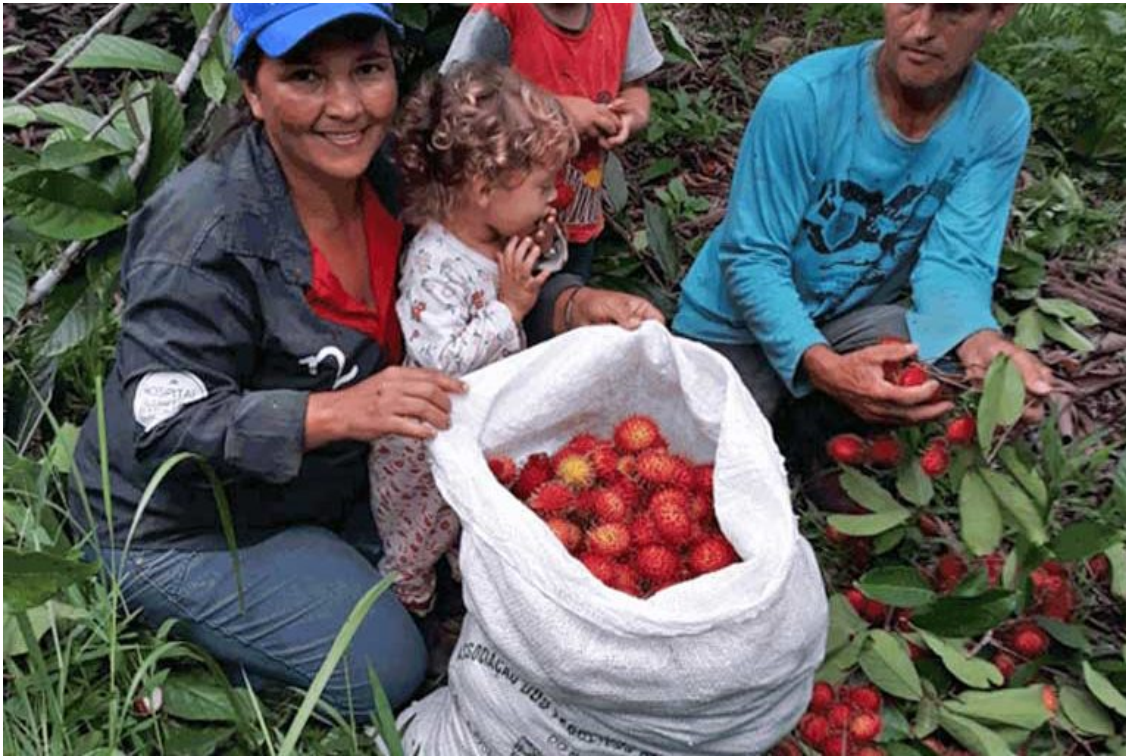
A family taking part in a REDD project in Brazil called the Consortium and Densified Economic Reforestation Project (RECA) harvests forest products.

is promoting what could be the biggest land grab of all time.” I first learned about REDD in December 2009, from leaders of the Indigenous Environmental Network, when we participated at the Klimaforum09, the counter-summit shadowing the 2009 UN Climate Change Conference COP-15 in Copenhagen, Denmark. “Everyone who cares about our future, forests, Indigenous Peoples and human rights should reject REDD because it is irremediably flawed, cannot be fixed and because, despite efforts to develop safeguards for its implementation, REDD will always be potentially genocidal,” Goldtooth said.