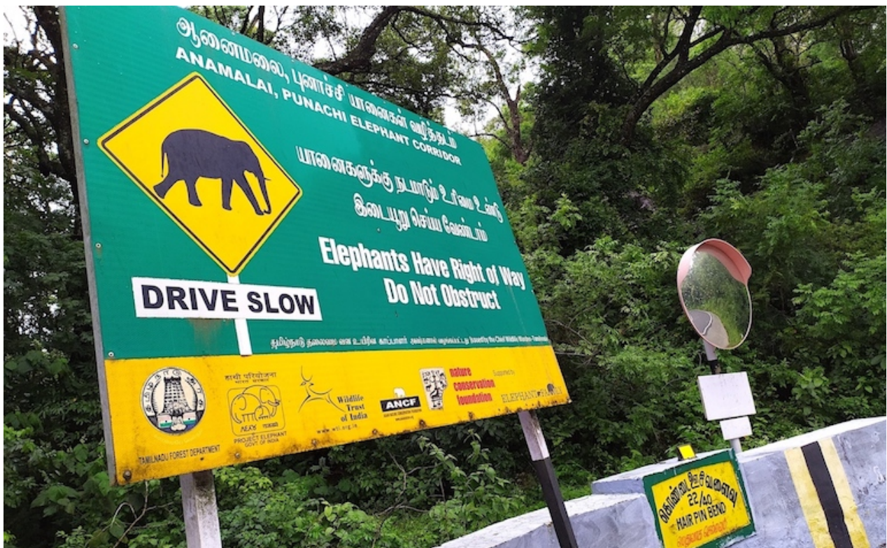
Elephants have the right of way on Highway SH-78 in the Western Ghats, India.

In particular, “Elephant Conservation Beyond Borders” was a memorable panel. No one talked about helping to save the endangered Asian elephants simply by increasing “Protected Areas” but instead, human rights defenders and species conservationists sat side-by-side and discussed transnational co-operation that also took into consideration the plight of the Rohingya refugees who were resettled along the migration corridors of elephants in Bangladesh. I learned that elephant conservation is no easy task in crowded South Asia.