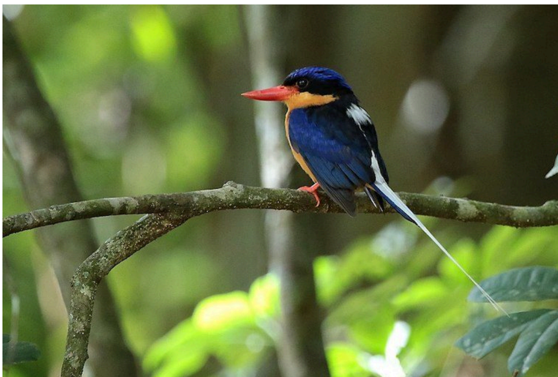
Buff-breasted paradise kingfisher at "Kingfisher Park," Julatten, North Queensland.

It's not that eminent biodiversity scientists like Edward O. Wilson and Thomas E. Lovejoy, whose scholarship and advocacy provided the foundation for the 30×30 biodiversity conservation proposal, do not have big ideas for wildlife conservation. Nor is it that a billion-dollar wildlife conservation initiative like " Campaign for Nature " does not know how to popularize and implement a wildlife conservation agenda. Nor is it that the influential " The age of extinction " series of the Guardian does not know how to publish some important articles on wildlife conservation.