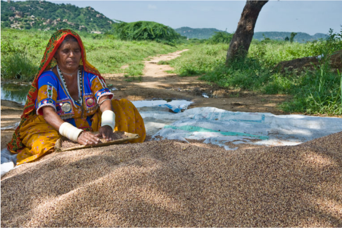
A Tribal woman cleaning grains in Andhra Pradesh, India.