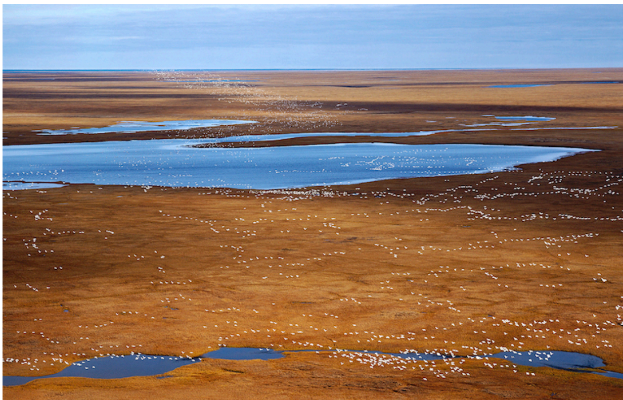
Snow geese over the Coastal Plain, Arctic National Wildlife Refuge, Alaska.

biodiversity crisis didn't make his list, the Secretary-General did briefly mention the "Shocking biodiversity loss."