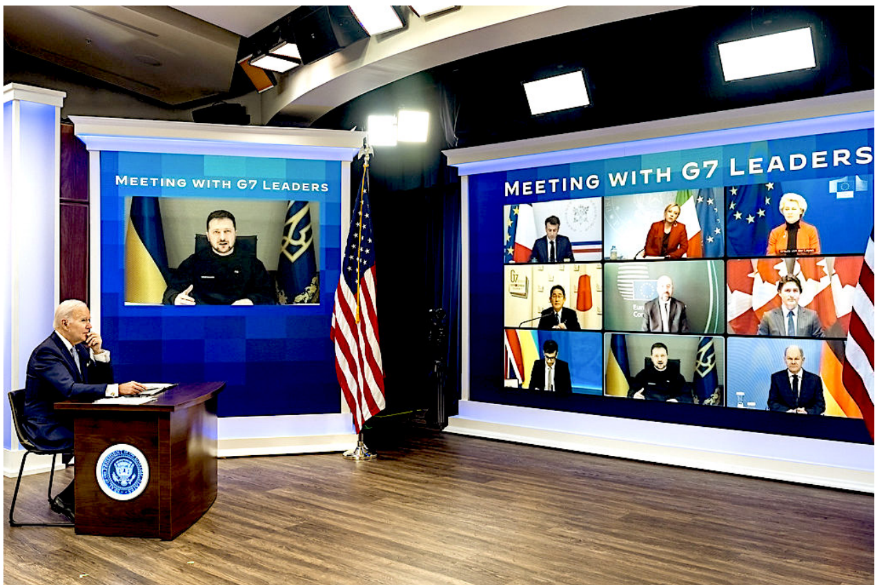
U.S. President Joe Biden in virtual call with G7 leaders and Ukrainian President Volodymyr Zelenskyy, Feb. 24.

Since the Russian invasion of Ukraine, an ideological divide that has gripped the world, with one side (led by the G7) condemning the invasion and seeking to punish Russia economically, and the other (led by BRICS) taking a more nuanced stance by neither supporting the Russian action nor joining in on the sanctions. This has created an intellectual vacuum when it comes to assessing the true state of play in global economic affairs.