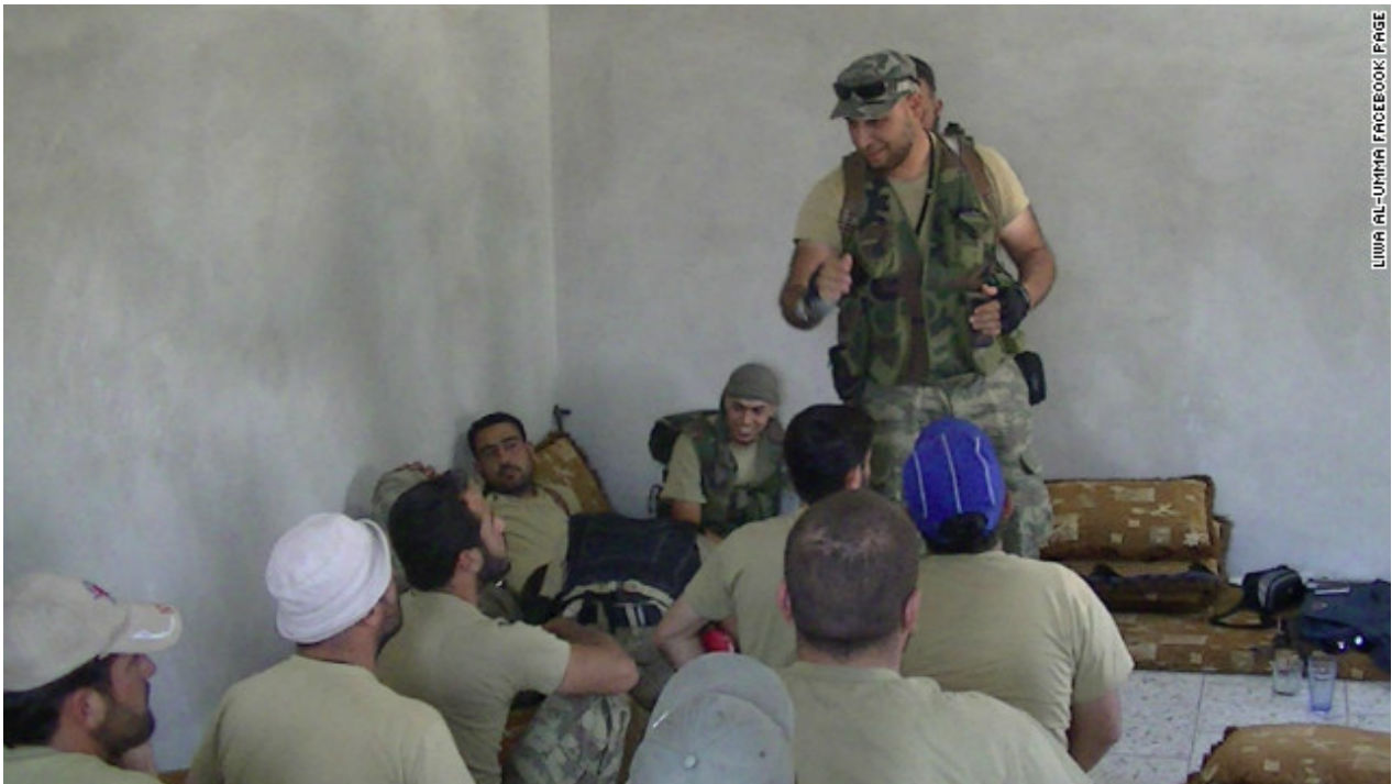
Image: Libyan Mahdi al-Harati of the US State Department , United Nations , and the UK Home Office (page 5, .pdf) -listed terrorist organization, the Libyan Islamic Fighting Group (LIFG), addressing fellow terrorists in Syria. Harati is now commanding a Libyan brigade operating inside of Syria attempting to destroy the Syrian government and subjugate the Syrian population. Traditionally, this is known as “foreign invasion.”