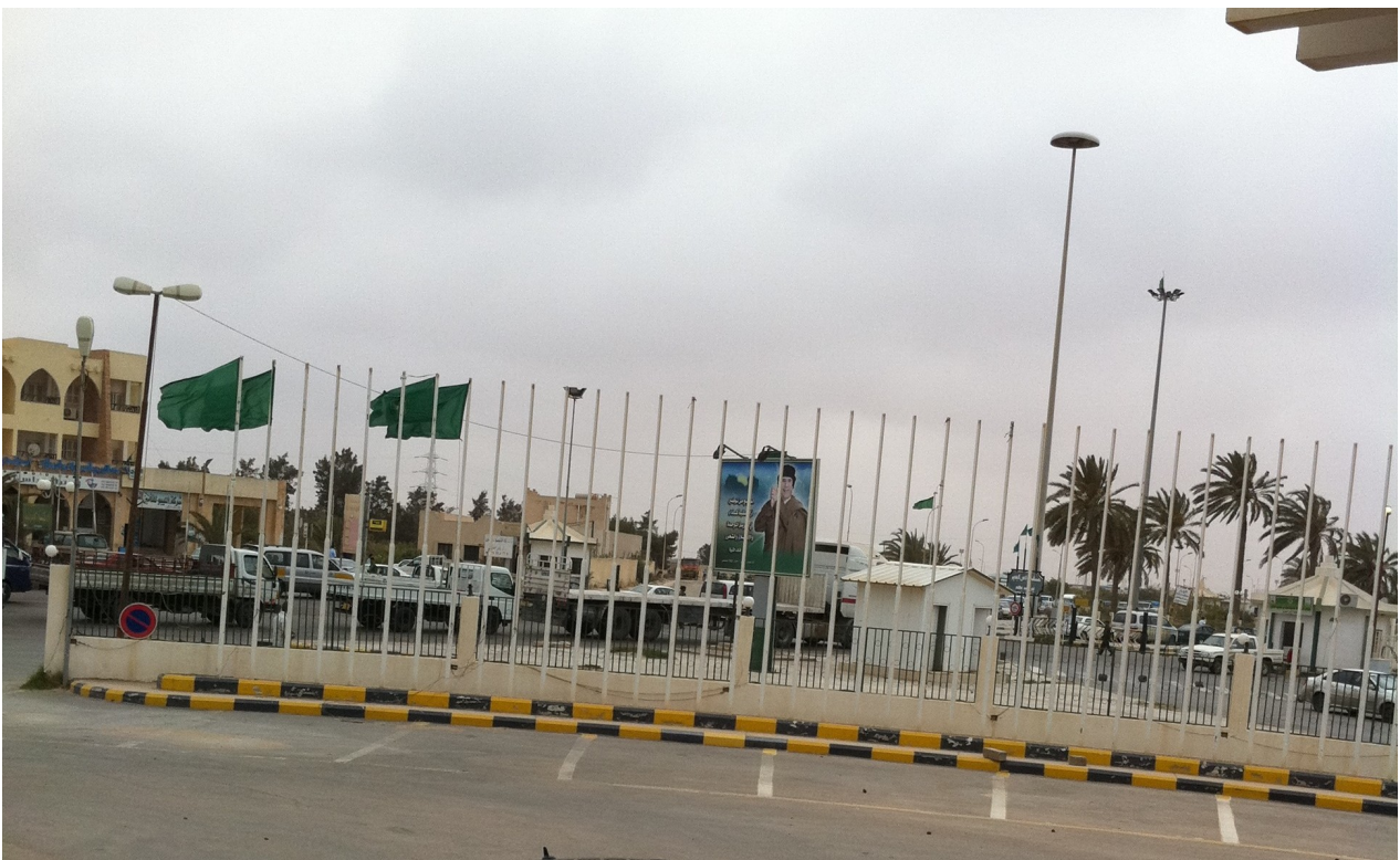
Qaddafi's portrait still ubiquitous in western Libya. Top is at a border crossing office. Bottom is at the border frontier.