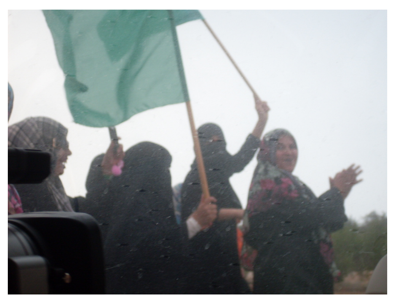
Spontaneous pro-Qaddafi demonstration on the main highway from Tunisia to Tripoli.