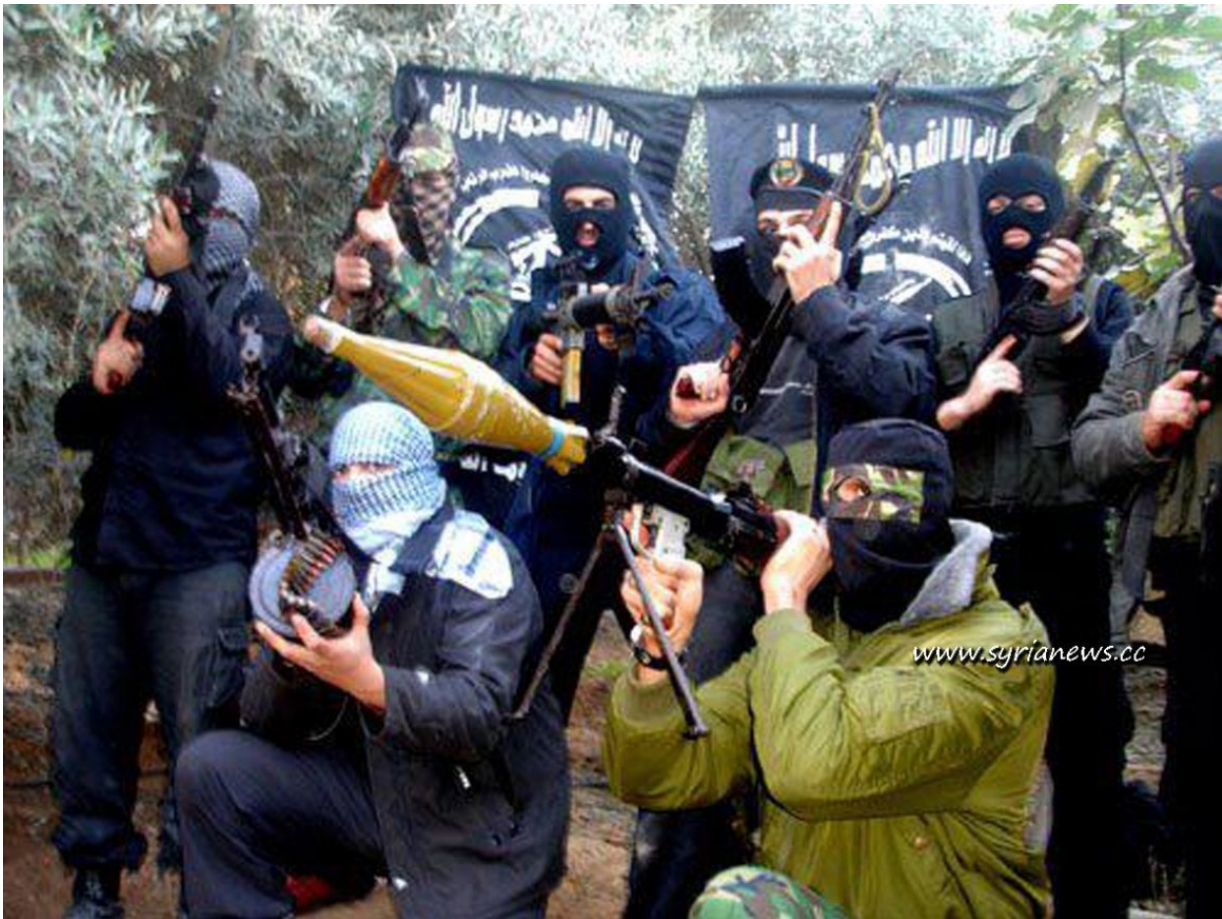
WESTERN DOUBLESPEAK: "Moderate Rebels" in Syria.

Despite now Washington's farcical legal evasion claiming how it is shipping arms into Syria in order to help the long-defunct, albeit aspirational construct, the 'Free Syrian Army,' in the supposed "fight against ISIS," bureaucrats can no longer hide their true intentions. It should also be noted that by arming internationally recognized terrorists fighters – Washington and any other allies involved in these illicit operations – are in direct violation of United States Anti-Terrorism laws, as well as similar European and international laws. However, because this has been a bipartisan effort from the beginning, co-steered by key Republicans including John McCain, Ed Royce, and Mike Rogers – no such indictments may ever be brought against Washington's criminal weapons traffickers. If such a case were ever prosecuted, then every US politician involved in this operation, both Democrat and Republican as well as agency officials, could, in theory, be charged with providing material support and lethal aid to known terrorist entities. Perhaps for this reason, the US and its allies have avoided specifically naming Al Nusra Front and its terror affiliates in most of the language in their official pronouncements of 'rebel' support.