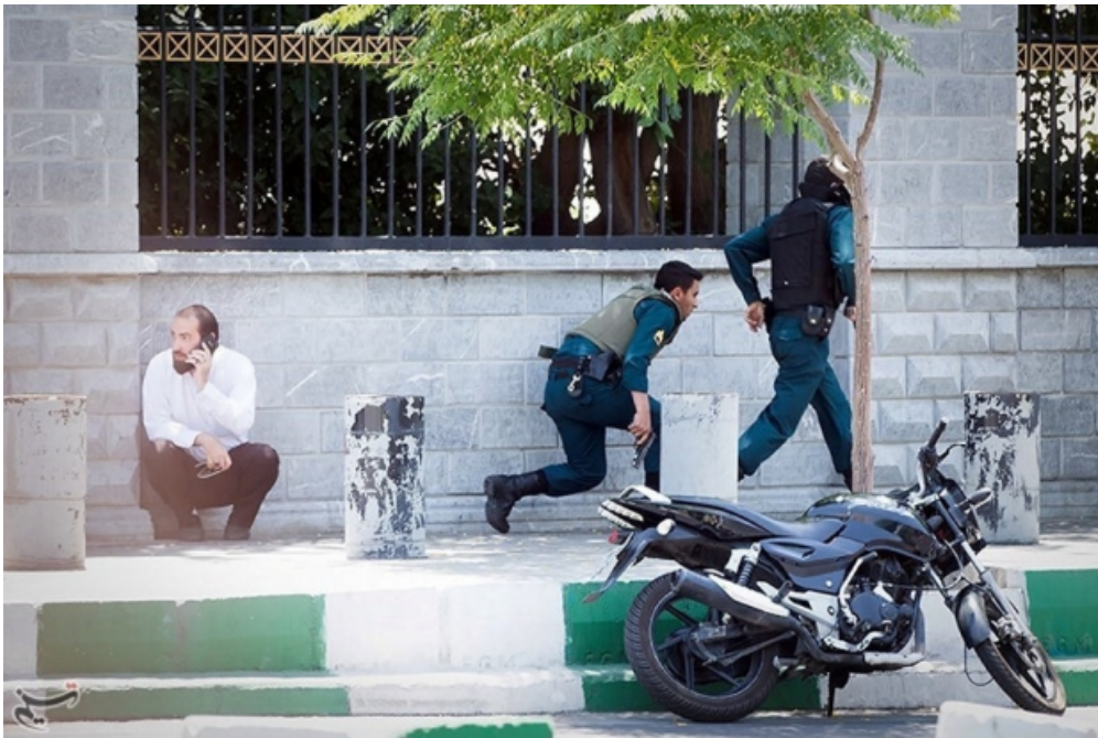
Members of Iranian forces run during an attack on the Iranian parliament in central Tehran

"I was inside the parliament when shooting happened. Everyone was shocked and scared. I saw two men shooting randomly," said one journalist at the scene, who asked not to be named.