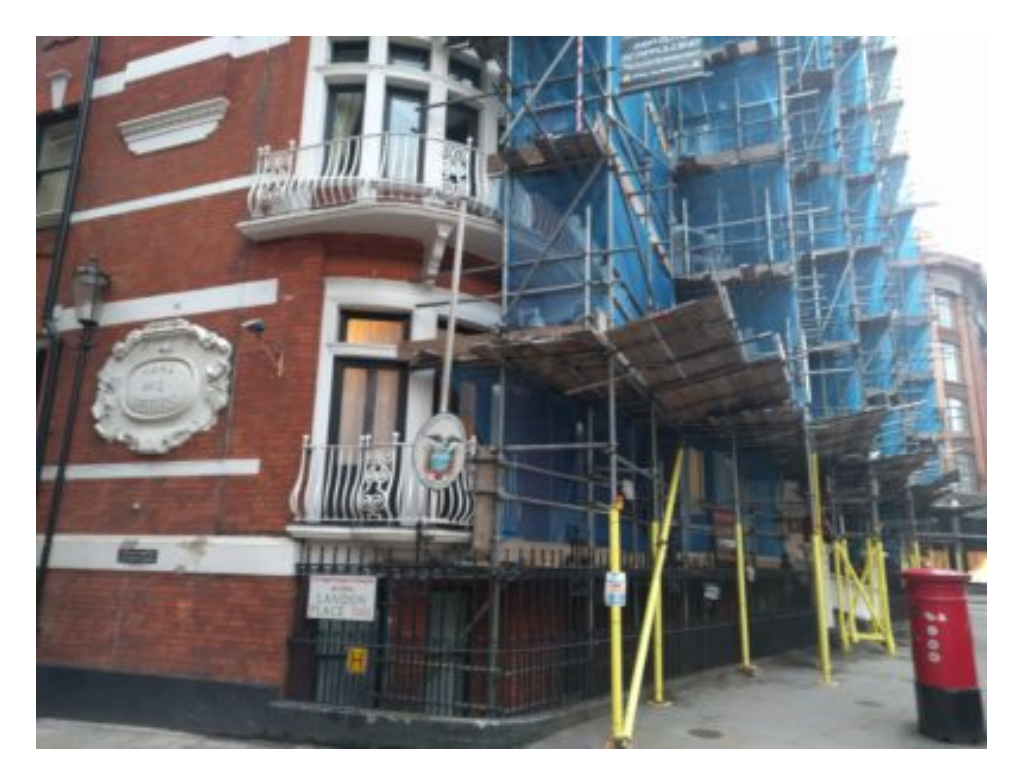
Scaffolding near balcony where Assange has appeared. (Sean O'Brien)

Scaffolding has appeared against the embassy building in the Knightsbridge section in London, which "obscures the embassy's security cameras," the lawyers said.