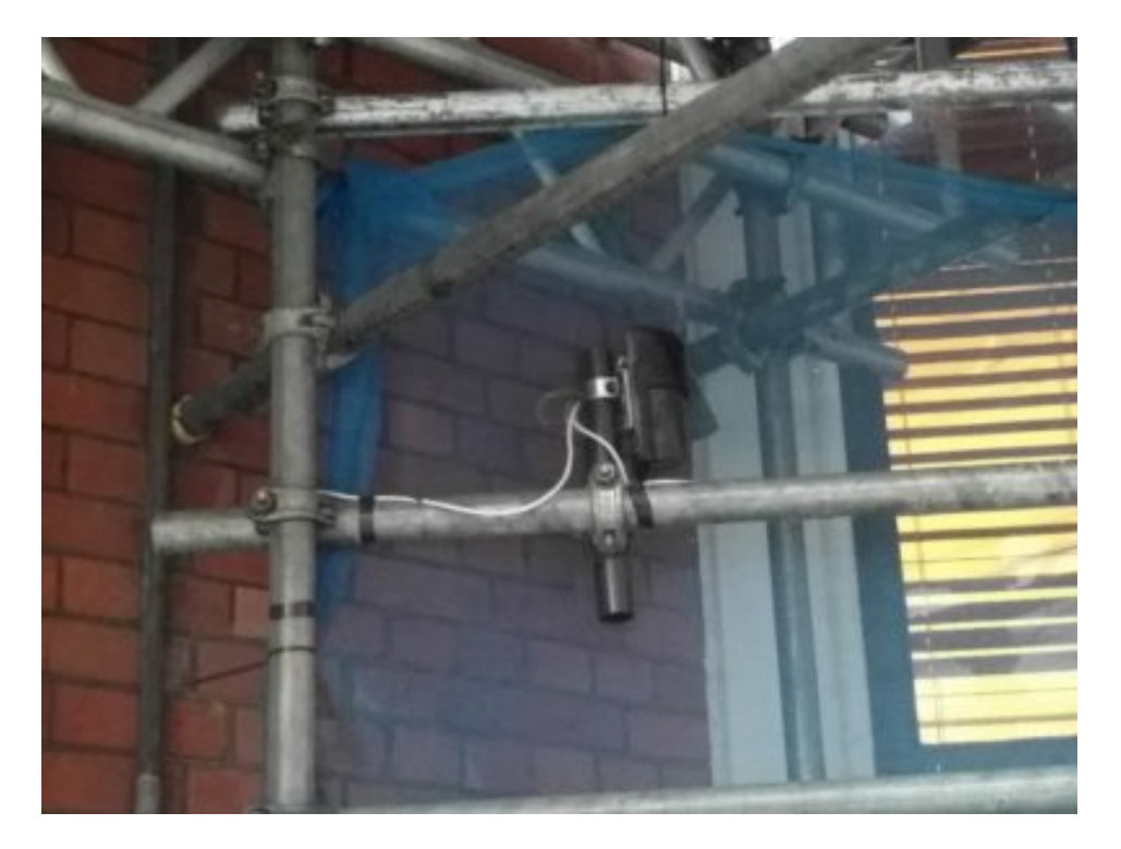
Another device. (Sean O'Brien)

guards manning the desk at all times. Privacy drapes, dark rooms with shuttered blinds. For such a reversal of position to have occurred, there is only one conclusion: the Ecuadorian Embassy is open for business. Wide open."