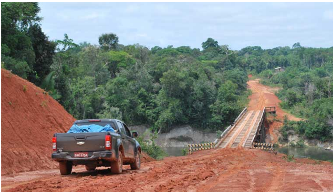
The BR-319 is now passable in the dry season due to a "maintenance" program begun in 2016.

Instead, the recommendations for avoiding the massive impacts are limited to the standard call for "governance," but the chances of such a program being implemented on a scale that would avoid disaster are near zero. The BR-319 area is essentially lawless today, with land grabbing ( grilagem ) and illegal land invasions, logging and building of side roads occurring with impunity. It is simply fictitious that " BR-319 will be an example of sustainability for the World ," as the members of the Legislative Assembly of the state of Amazonas claim.