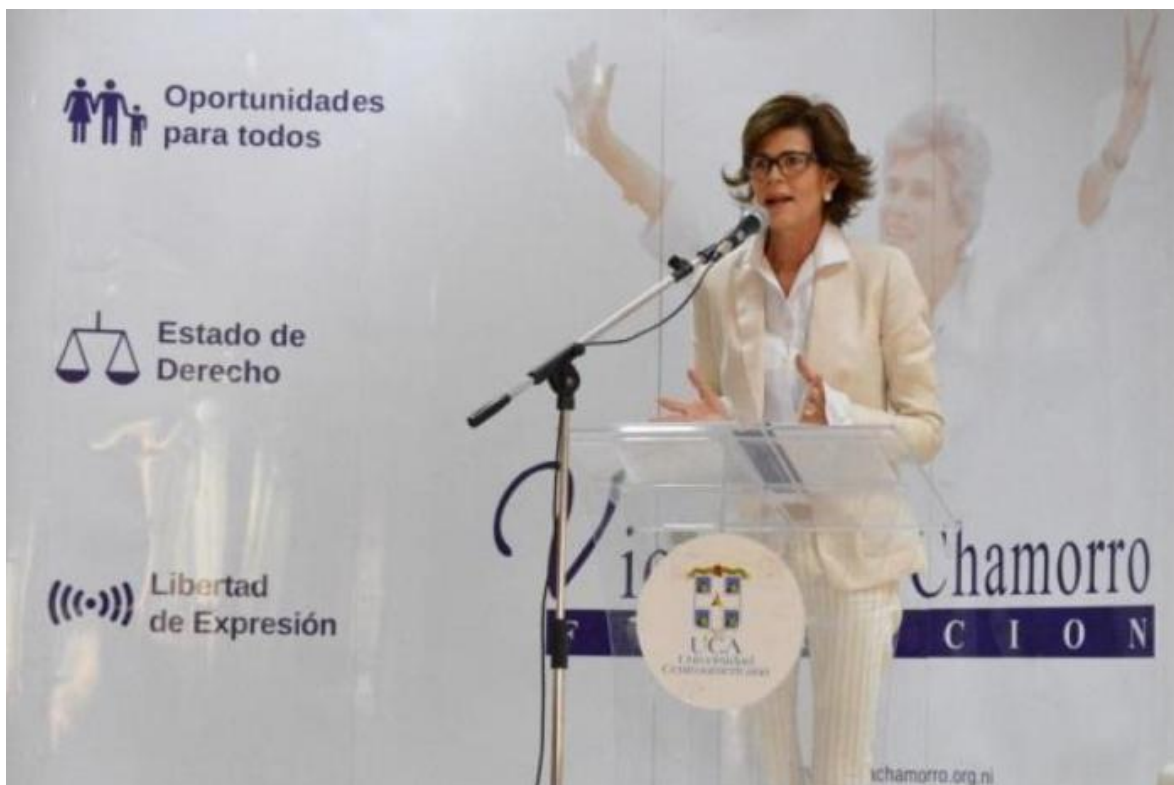
Violeta Chamorro speaks before foundation.