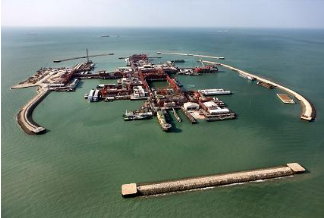
Oil rigs in the Caspian Sea—which the U.S. wanted to control over Russia.

Some $302 million was provided to the Georgian government of Eduard Shevardnadze, who had come to power in a coup d'état backed by the Western powers which toppled nationalist Zviad Gamsakhurdia, who died under suspicious circumstances a year later. [9]