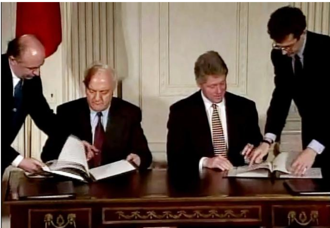
Eduard Shevardnadze and President Clinton sign a bilateral investment treaty at the White House in March 1994.

Some $302 million was provided to the Georgian government of Eduard Shevardnadze, who had come to power in a coup d'état backed by the Western powers which toppled nationalist Zviad Gamsakhurdia, who died under suspicious circumstances a year later. [9]