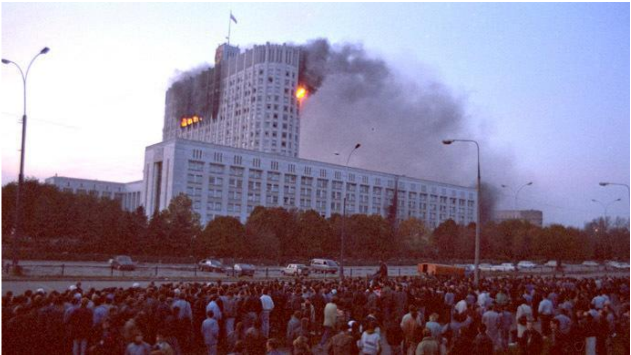
Burning of Russian parliament on Yeltsin's order after constitutional crisis in October 1993.

The Clinton administration went on to sabotage Russian democracy further when it intervened to rig the 1996 Russian election on Yeltsin's behalf.