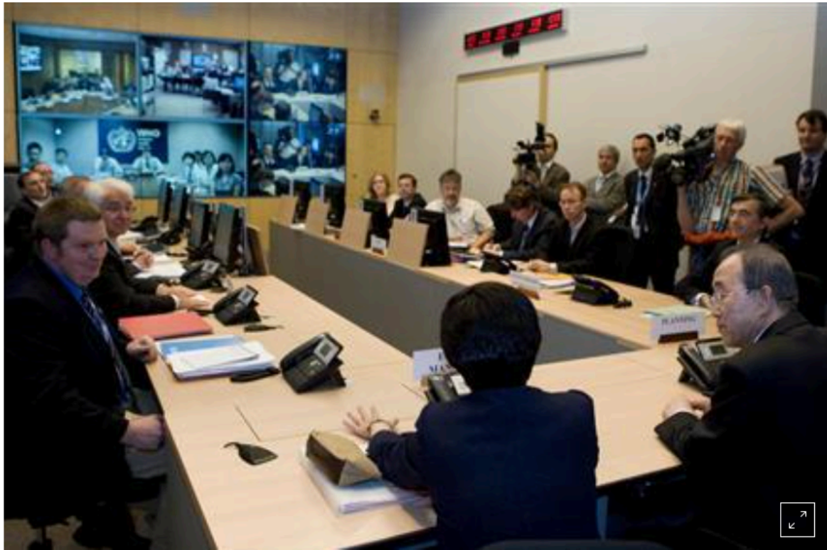
United Nations Secretary-General Ban Ki-moon (R) listens to WHO Director-General Margaret Chan (C) during a visit to the Strategic Health Operations Centre (SHOC) room at the World Health Organization (WHO) headquarters in Geneva, May 19, 2009.

GENEVA (Reuters) - Vaccine makers could produce 4.9 billion pandemic flu shots per year in the best-case scenario, the head of the World Health Organization said on Tuesday, as rich and poor countries grappled over limited supplies.