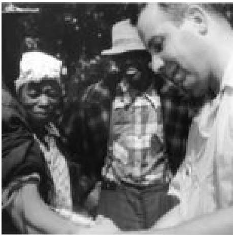
Image on the right: Tuskegee Syphilis Study 1932-1972

For more than 40 years, another case of immorality, unethical medical standards and neglect occurred in Macon County, Alabama with the Tuskegee Syphilis Study that began in 1932 and ended in 1972. The experiment was conducted by the U.S. Public Health Service (PHS) as a way to study the “natural progression” of syphilis with more than 600 sharecroppers which in this case, can be regarded as lab rats from the black community with at least 399 of them who had the syphilis infection and the remaining 201 who did not reportedly have the disease.