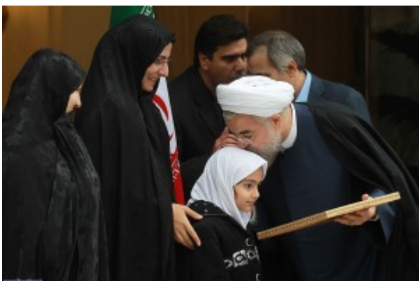
Iran's President Hassan Rouhani celebrates

Official pronouncements on critical national security matters need to be based on facts. Hyperbole in describing Iran's terrorist activities can be counterproductive. For this reason, we call attention to Ambassador Nikki Haley's recent statement that it is hard to find a "terrorist group in the Middle East that does not have Iran's fingerprints all over it." The truth is quite different. The majority of terrorist groups in the region are neither creatures nor puppets of Iran. ISIS, Al-Qaeda and Al-Nusra are three of the more prominent that come to mind.