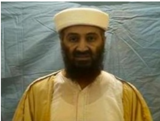
The late Al-Qaeda leader Osama bin Laden.

"JSOC personnel also worked with the Mujahideen-e-Khalq (MEK), a militant Iranian exile group that had based itself in Iraq after falling afoul of the ayatollahs' regime in Tehran. The State Department had placed the MEK on its list of designated terrorist organizations, but that didn't stop JSOC from taking an attitude of "the enemy of my enemy is my friend" toward the group. "They were a group of folks that could transit the border, and they were willing to help us out on what we wanted to do with Iran," said a special operations officer."