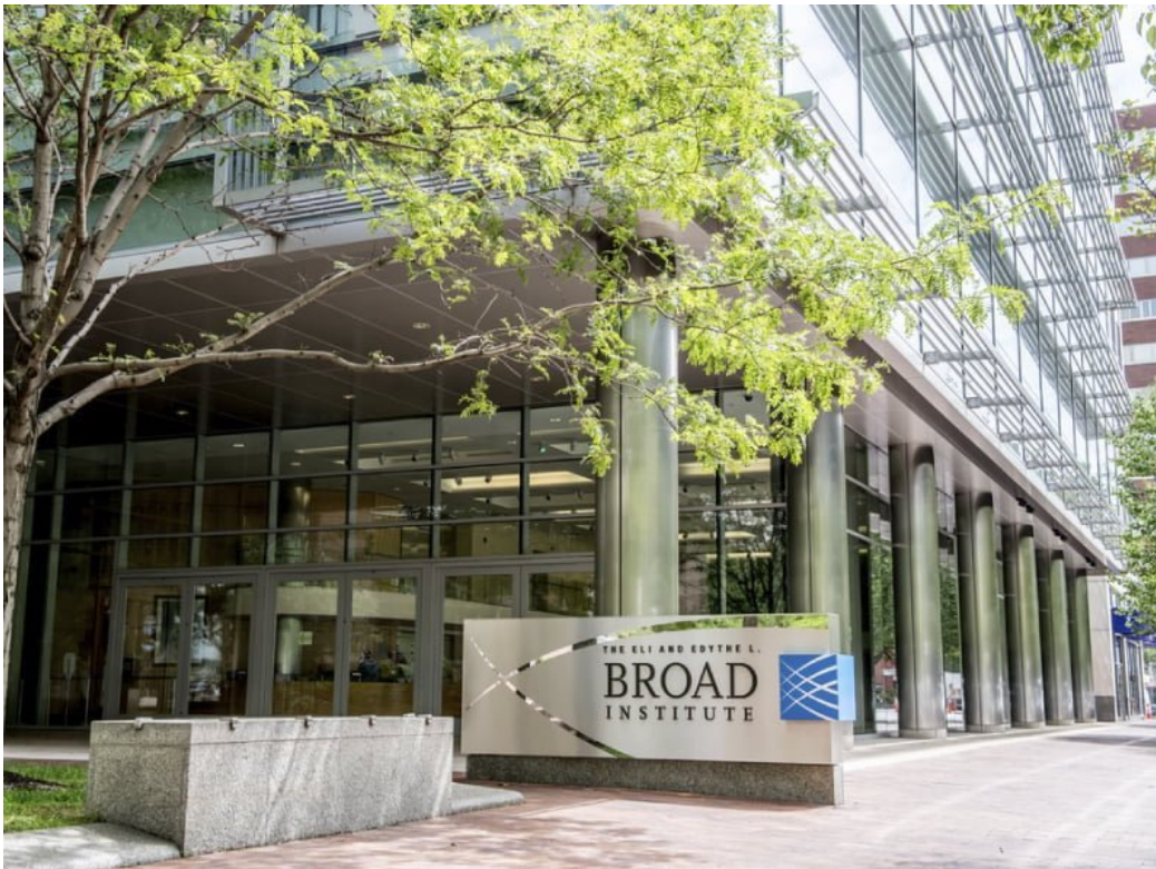
The Broad Institute

Former Google CEO Eric Schmidt, who was intimately involved with Obama's 2012 reelection campaign and who is close to the Democratic Party in general, chairs the Broad Institute as of this April. In March, Schmidt gave the institute $150 million to "connect biology and machine learning for understanding programs of life." During his time on the Broad Institute board, Schmidt also chaired the National Security Commission on Artificial Intelligence, a group of mostly Silicon Valley, intelligence, and military operatives who have now charted the direction of the US government's policies on emerging tech and AI. Schmidt was also pitched as potential head of a tech-industry task force by the Biden administration.