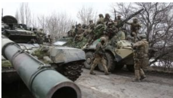
Image: Ukrainian troops prepare to fight Russian forces in Donbass

When the UN Security Council unanimously adopted Resolution 2199 on February 12, 2015, which called on the countries involved (mainly Ukraine, Russia and the United States) to respect the two Minsk agreements of September 5, 2014 and of February 12, 2015, a diplomatic solution seemed possible.