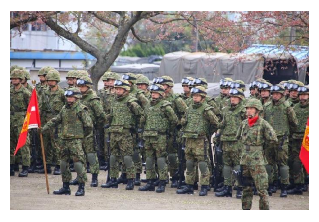
Japanese Self-Defense Force, 6<sup>th</sup> Division.

The effort to "reinterpret" Article 9 has been a continuing political struggle inside Japan. Mass rallies of hundreds of thousands have mobilized many times in defense of Article 9, which offers a clear prohibition of Japan's maintaining a military force. The widespread opposition to the Japanese military and to constitutional change comes from working people, mobilized by the unions and the communist and socialist movements.