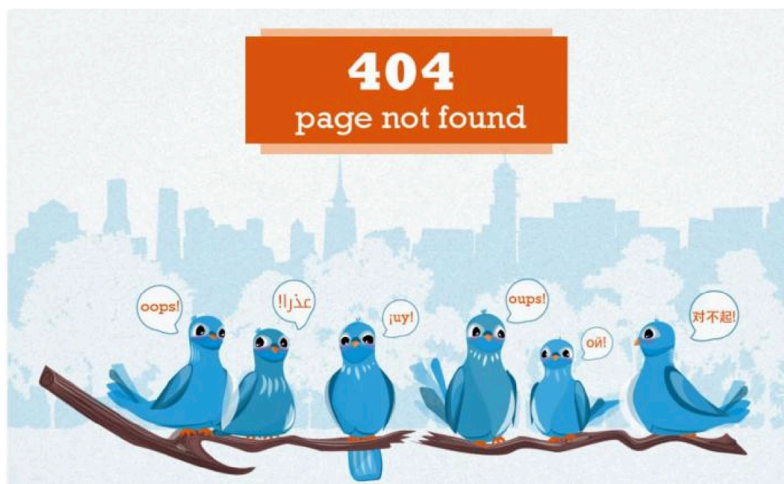
UN error page

Titled “The Benefits of World Hunger,” the post sparked outrage among Twitter users on Wednesday. Following criticism of the article, the link now leads to an error page.