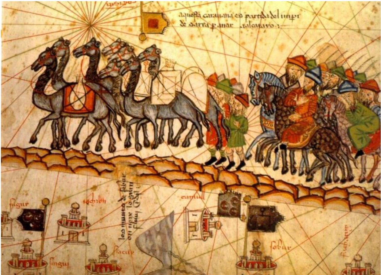
Catalan Atlas, detail showing family Of Marco Polo 1254-1324 traveling by camel caravan, 1375, drawing by Spanish School.

Let's not forget this moment in time also resonates with the 13th century, when Venetian Marco Polo, traveling through the Silk Roads to Asia, brought back to Europe the freshness of the Eastern winds, with news from Kublai Khan's Yuan Dynasty, including the "sublimation" of money into a lighter form, from coin to paper.