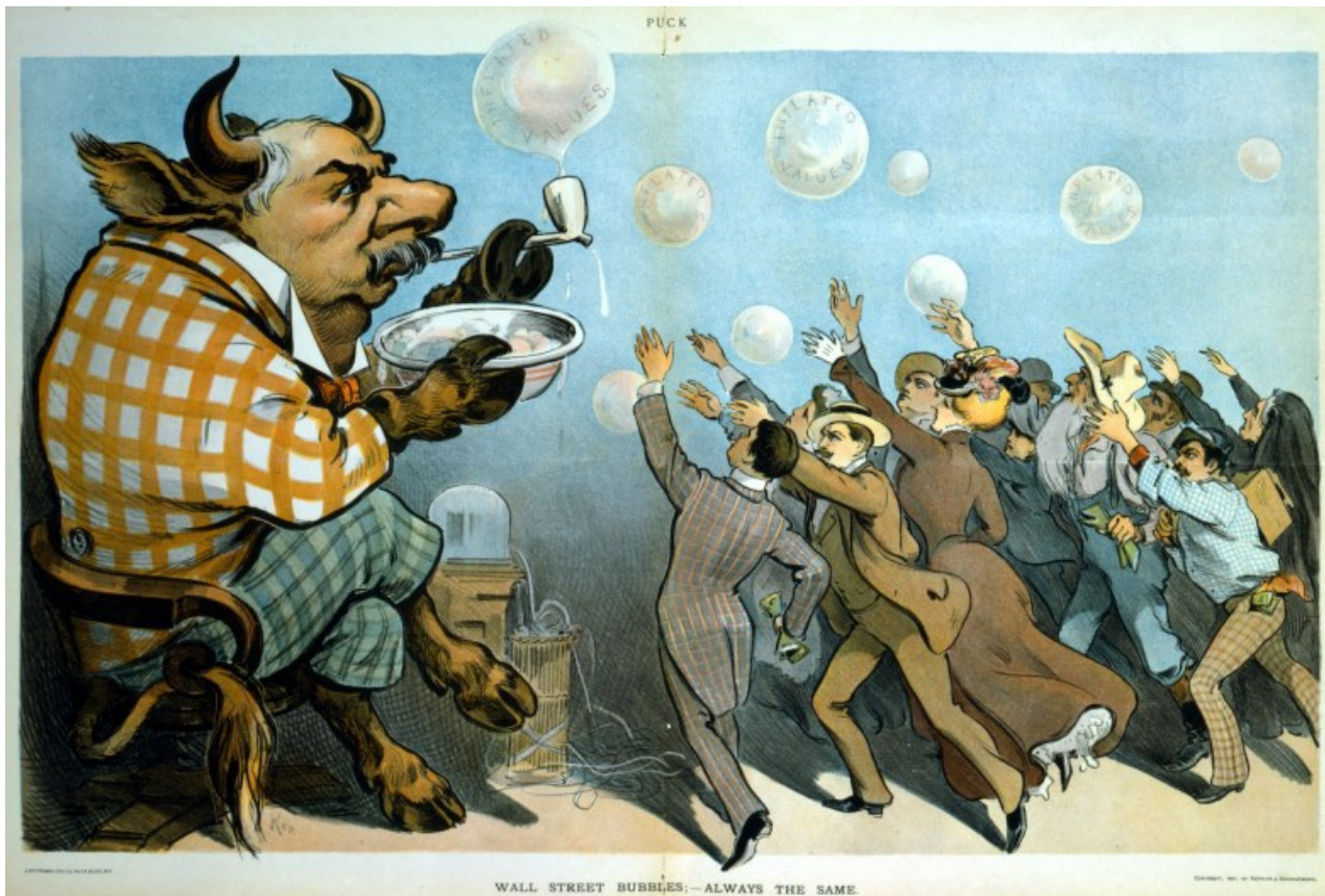
Image: 'Wall Street Bubbles – always the same,' 1901 cartoon by Keppler, depicts J.P. Morgan as a bull blowing soap bubbles for eager investors.

The nefarious potential of the Aquarian emphasis is the control of society through technology, be it techno-feudalism or, gods forbid, techno-slavery. On the brighter side of the Force, Aquarius is about a social project to sustain life and meet the needs of the people. Both dimensions or systems might co-exist on Earth for a while.