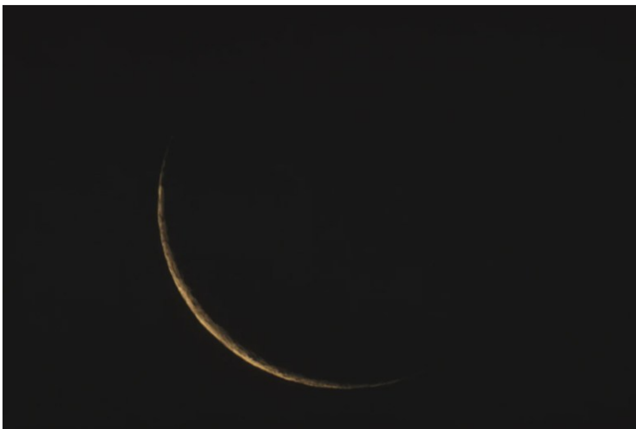
A nearly black moon.

An unprecedented worldwide collective experience – and experiment. Nevertheless, serving to shake it all up, transforming our very perception of time, preparing for the conception of a new time. To all those paying attention, a call to be yet more alive, more vivid, against all odds.