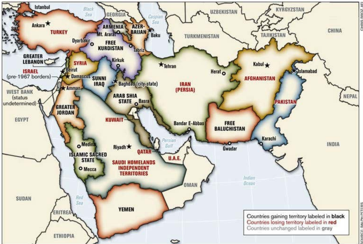
Ralph Peters Map: The Project for the New Middle East

It is also no coincidence that aside from a divided Iraq a divided Sudan was shown on the map. Lebanon, Iran, Turkey, Syria, Egypt, Somalia, Pakistan, and Afghanistan were also presented as divided nations too. Of importance to East Africa in the map, illustrated by Holly Lindem for Goldberg's article, Eritrea is occupied by Ethiopia, which is a U.S. and Israeli ally, and Somalia is divided into Somaliland, Puntland, and a smaller Somalia.[6]