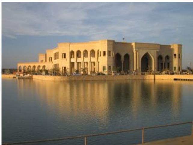
Al Faw Palace

palace to the North of the Airport is termed “Presidential Palace North” — otherwise known as the Qasr Al-Faw Palace. “