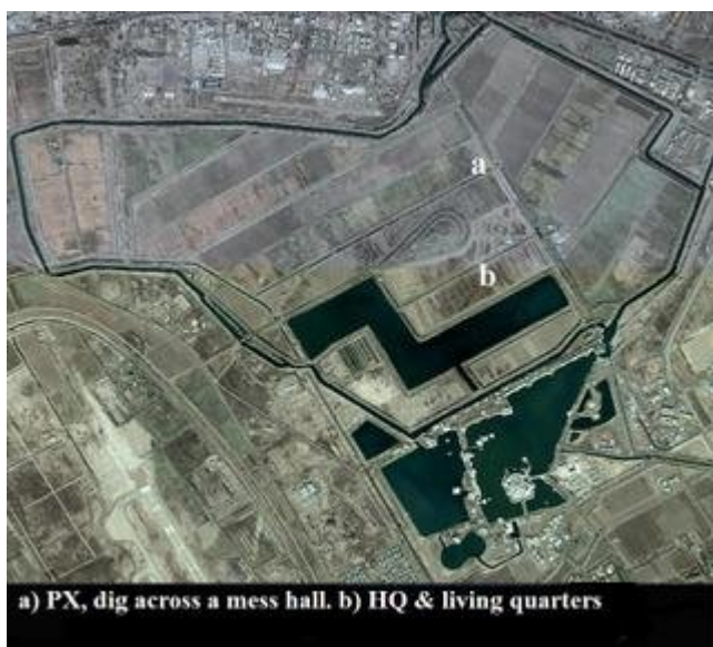
Camp Liberty - Camp al-Tahreer Baghdad,

East of the airport, it “is a chief meeting ground for military and civilian officials and dignitaries.” Self-sufficient medical aid station, satellite internet.