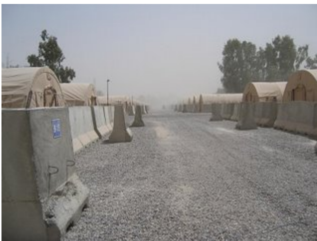
Camp Sather

Around Baghdad airport, there are several US camps which will presumably be dismantled and incorporated into Camp Victory and Camp Liberty. These small camps are: Camp Sather, Camp Dublin, Camp Slayer, Camp Stryker, Camp Victory and Logistics Base Seitz. There are also two known detention facilities: Camp Nana (now said to be closed) and Camp Cropper.