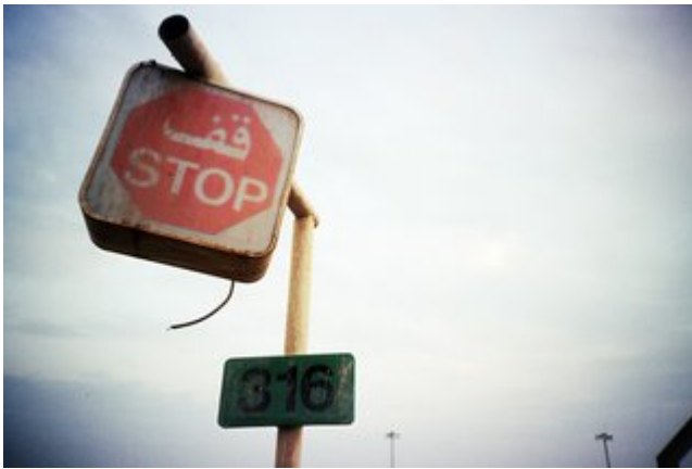
Baghdad Airport Signal