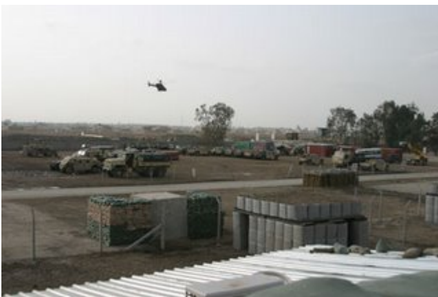
Log Base Seitz

Camp Griffin is responsible for radar in the northern 2/3rds of Iraq. (UK responsible for 1/3rd S. Iraq). There is much more information on Camp Griffin in the US civil war than there is on this camp in Iraq.