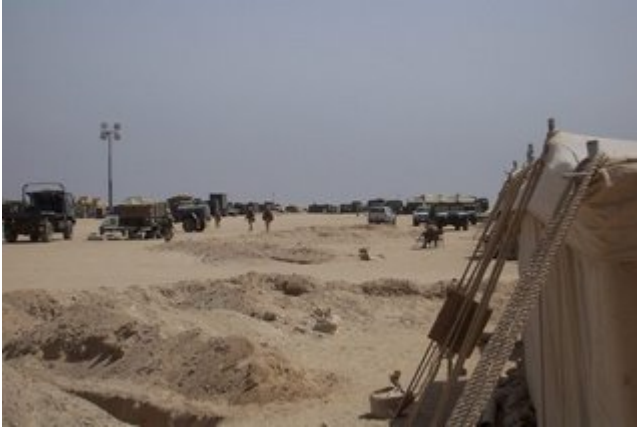
Camp Thunder

enough that soldiers wandered into the town of Abu Ghraib for supplies, they ate in Iraqi restaurants and talked to Iraqis on the streets. Those days are long gone. Now the logistical base is considered by some disgruntled soldiers as a mortar magnet and a buffer zone for the much larger Camp Victory right next door ... The worst times are when I stand and listen, over the generators, trucks and soldier noise, to the call to prayer outside the base walls. I can't reach that Iraq right now, and I know that no one inside could even understand why I would want to ... They have no understanding of Iraqis or Iraqi culture outside of framing them as killers and "heathens." And why would they?" It is a good blog, written with much integrity. Read it.