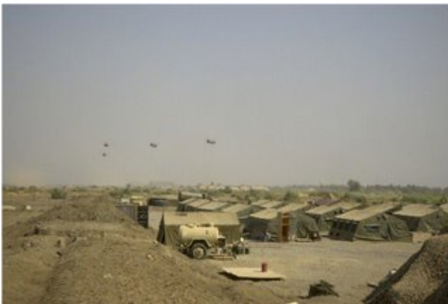
Camp Griffin

The US frown on hiring Iraqis. “Teams of Asian men , mostly hired by Kellogg, Root and Brown, clean the latrines and showers, fix electrical problems, cook the food in the chow hall and run the laundry, recreation facility and the local PX.” For this, one day a month holiday, without pay, is allowed.